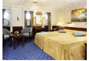
Owner's Suite (top), a deluxe cabin on Cabin Deck (above)

The sailing yacht Sea Cloud II is a three-masted barque steeped in the elegance of yesteryear and complemented with the most modern amenities. Sister ship of the legendary Sea Cloud , Sea Cloud II celebrated her 15th anniversary in 2016. From her 47 beautifully appointed outside cabins, mahogany-paneled library, and gracious lounge to the fitness area and water sports platform, no detail has been overlooked. Praised by the world's most discerning travelers, Sea Cloud II receives consistent high rankings from Condé Nast Traveler . ■