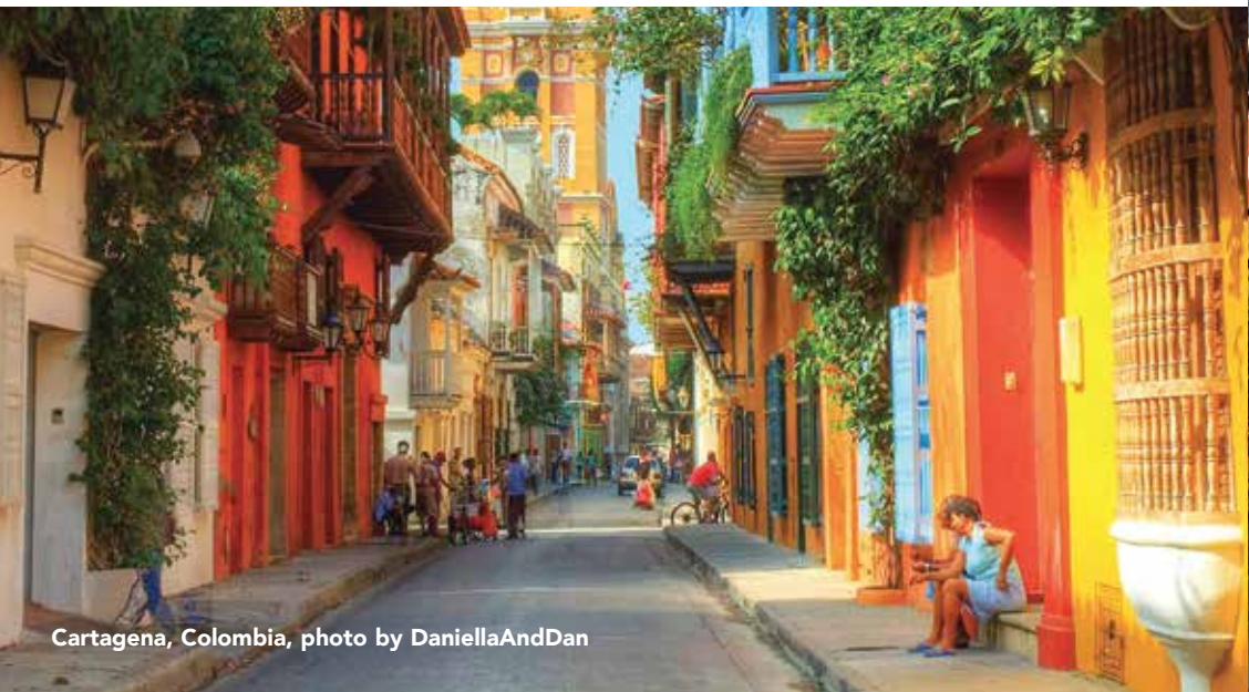
Cartagena, Colombia, photo by DaniellaAndDan