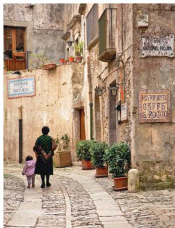
Palermo street scene

We travel across Sicily’s southern reaches today to Syracuse (Siracusa), stopping along the way in Piazza