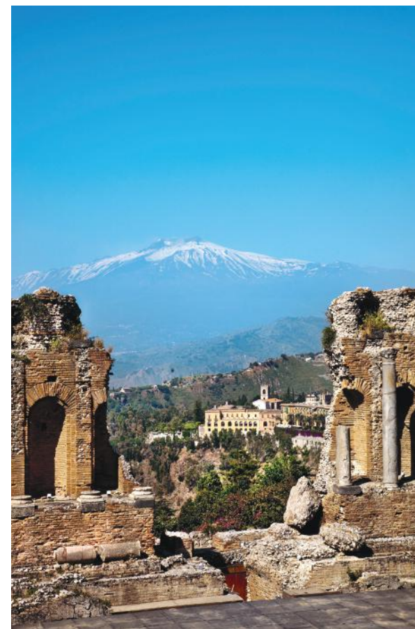
Taormina’s ancient theater overlooks Mt. Etna.

Day 12: Depart for U.S. We transfer today to the Catania airport for our return flight to the U.S. B