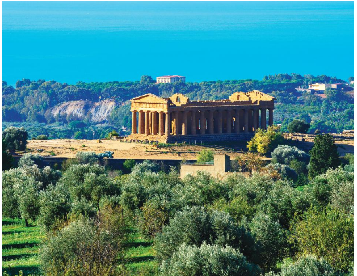
On Day 6, we explore the Valley of the Temples in the hilltop city of Agrigento. Above: Temple of Concordia

Crossroads of the Mediterranean ... the “toe” in Italy’s boot ... “God’s Kitchen” ... Sicily is all this, and much more, as we see on our stellar small group journey around this Italian island. It’s lively cities and ancient ruins, temples of man – and of nature, hospitable people and delectable cuisine ... a feast for all the senses.