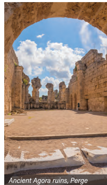
Ancient Agora ruins, Perge