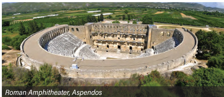
Roman Amphitheater, Aspendos

CAPPADOCIA: Explore in the morning Goreme, the honey-colored village carved out of the hills, and visit the Goreme Open-Air Museum, a UNESCO World heritage site, that consists of several rock-cut churches and chapels. Continue to Pasabagi ("Monks' Valley"), a landscape dominated by conical formations of tuff, and renowned for its mushroom-shaped fairy chimneys that were once inhabited by monks. After lunch at a local