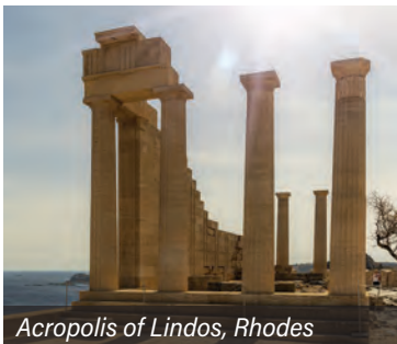
Acropolis of Lindos, Rhodes

SANTORINI: Be on deck this morning as the ship approaches Santorini to admire one of the most memorable sights in the