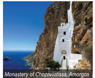
Monastery of Chozoviotissa, Amorgos