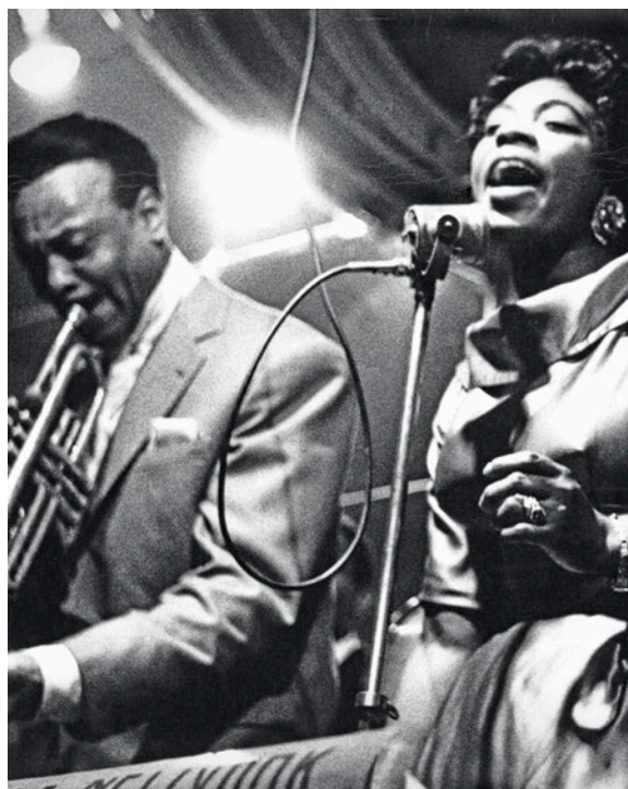
A jazz club in Paris, 1960

Following World War I, many African American expatriates found acceptance and opportunities in Paris. During carefully curated excursions, trace the path of Black performers, literary greats and luminaries who were instrumental in shaping French culture. See famous Parisian hangouts, enjoy a jazz concert, cruise the Seine River and delight in delectable French cuisine. Return home with an understanding of the contributions and influences made by African American expatriates.