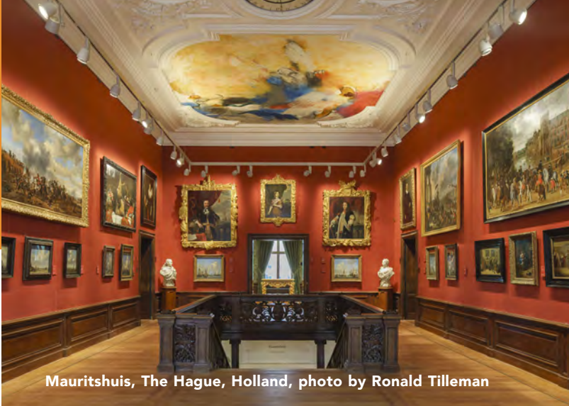
Mauritshuis, The Hague, Holland