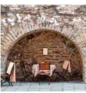
Historic Center (Old Town) of Tallinn, Estonia

Viru Gate, Old Town, Tallinn UNESCO World Heritage Old Town, Tallinn