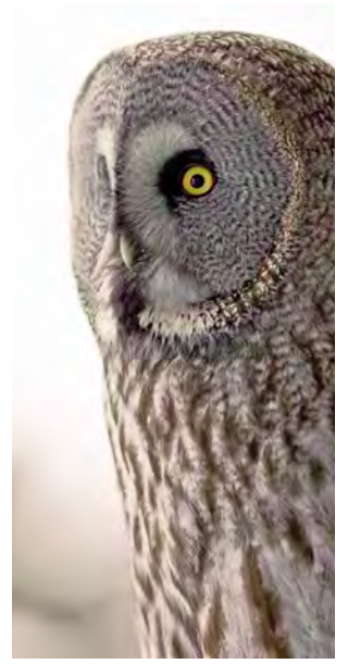
Great Grey Owl, Lapland