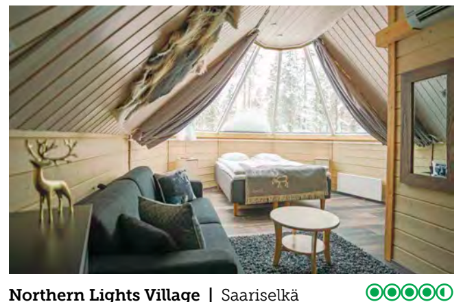
Northern Lights Village | Saariselkä