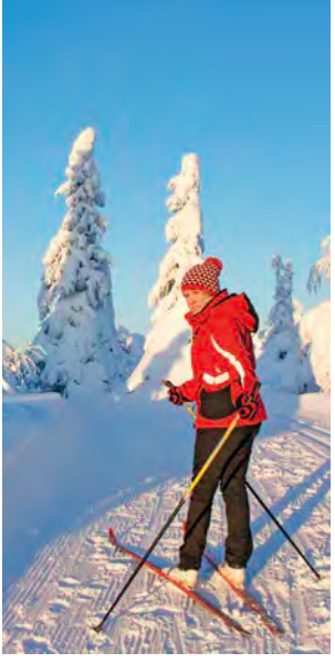
Exploring at Northern Lights Village