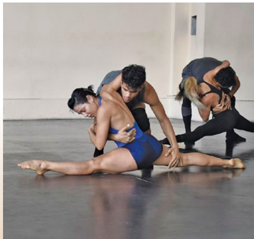
Contemporary Cuban dancers