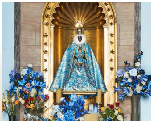
Black Madonna, Iglesia de Nuestra Señora de Regla

Also visit the Sugar Mill Triunvirato, the site of the 1843 Rebellion of the Triunvirato. Finish your discovery of Matanzas with a performance by a local choir!