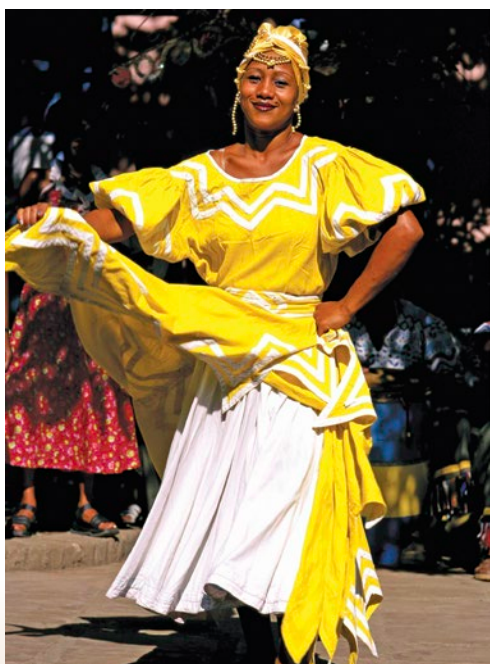
Top: Vintage automobiles, Havana Cover: Cuban jazz musician Mail panel: Old Havana | Afro-Cuban musician