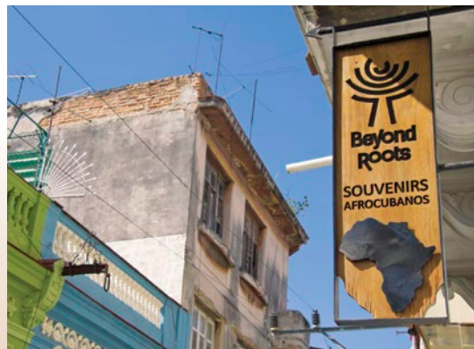
Beyond Roots, Havana

Inside an Art Studio. Cuba's art scene reflects a menagerie of African, North and South