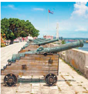
Cannons at fortification, Havana