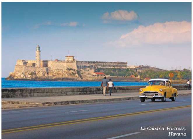
La Cabaña Fortress, Havana