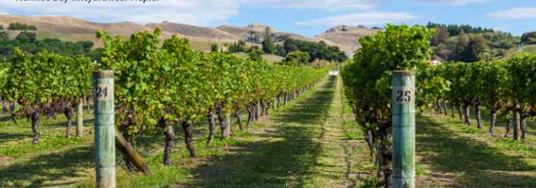
Hawke's Bay vineyard near Napier

Spend your final day in New Zealand in the storied city Christchurch for a tour that showcases the highlights—including the Mona Vale Gardens and the Canterbury Earthquake Memorial. Enjoy lunch before returning to your home city. (B,L)