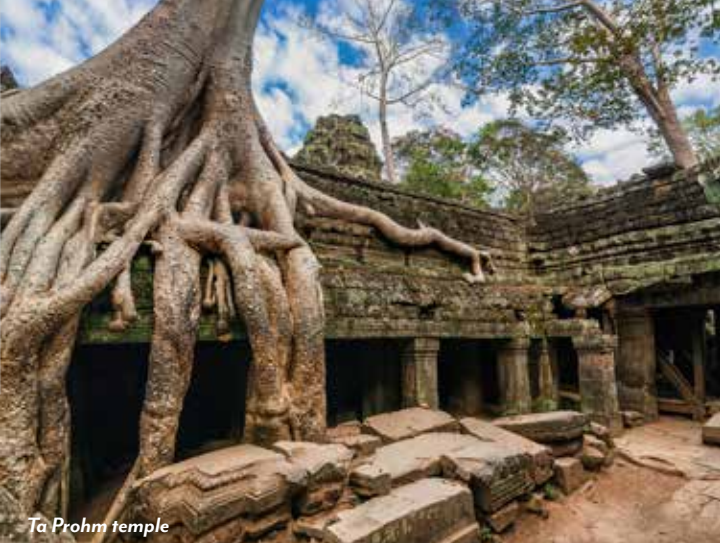
Ta Prohm temple