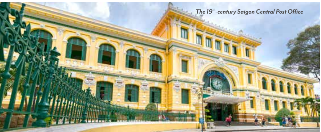
The 19 th -century Saigon Central Post Office

See breathtaking views of the coastline as you cruise from Da Nang to