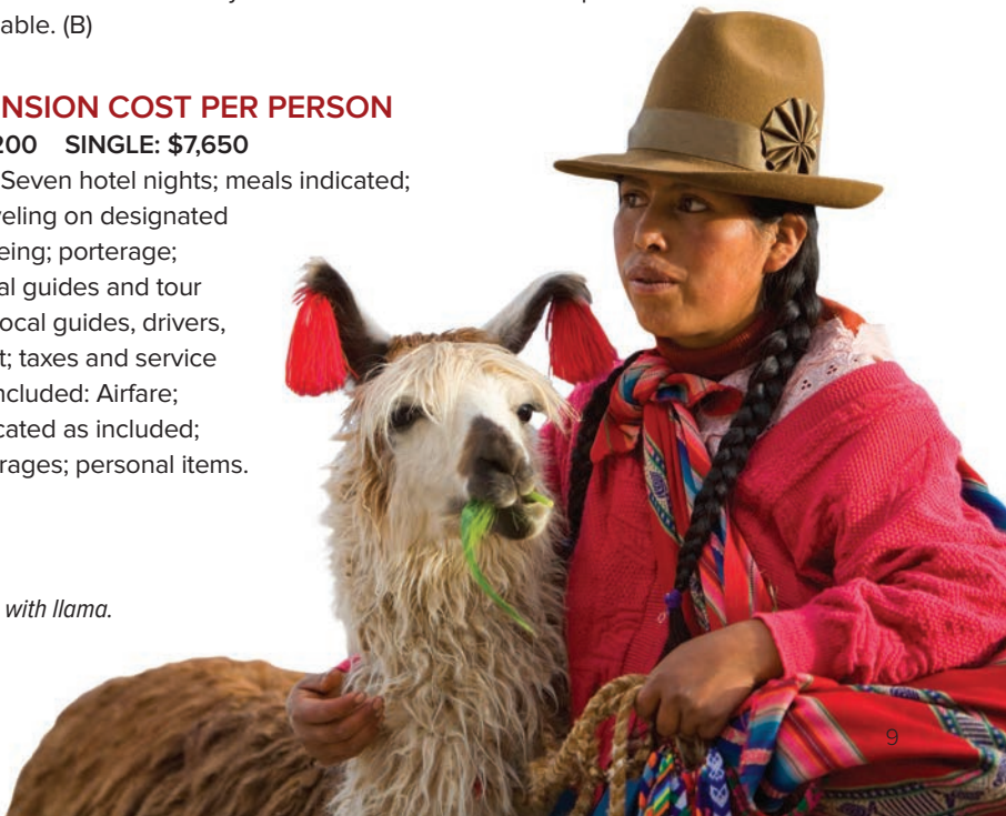
Peruvian woman with llama.

Cost Includes: Seven hotel nights; meals indicated; transfers if traveling on designated flights; sightseeing; portorage; services of local guides and tour escort; tips to local guides, drivers, and tour escort; taxes and service charges. Not Included: Airfare; meals not indicated as included; alcoholic beverages; personal items.