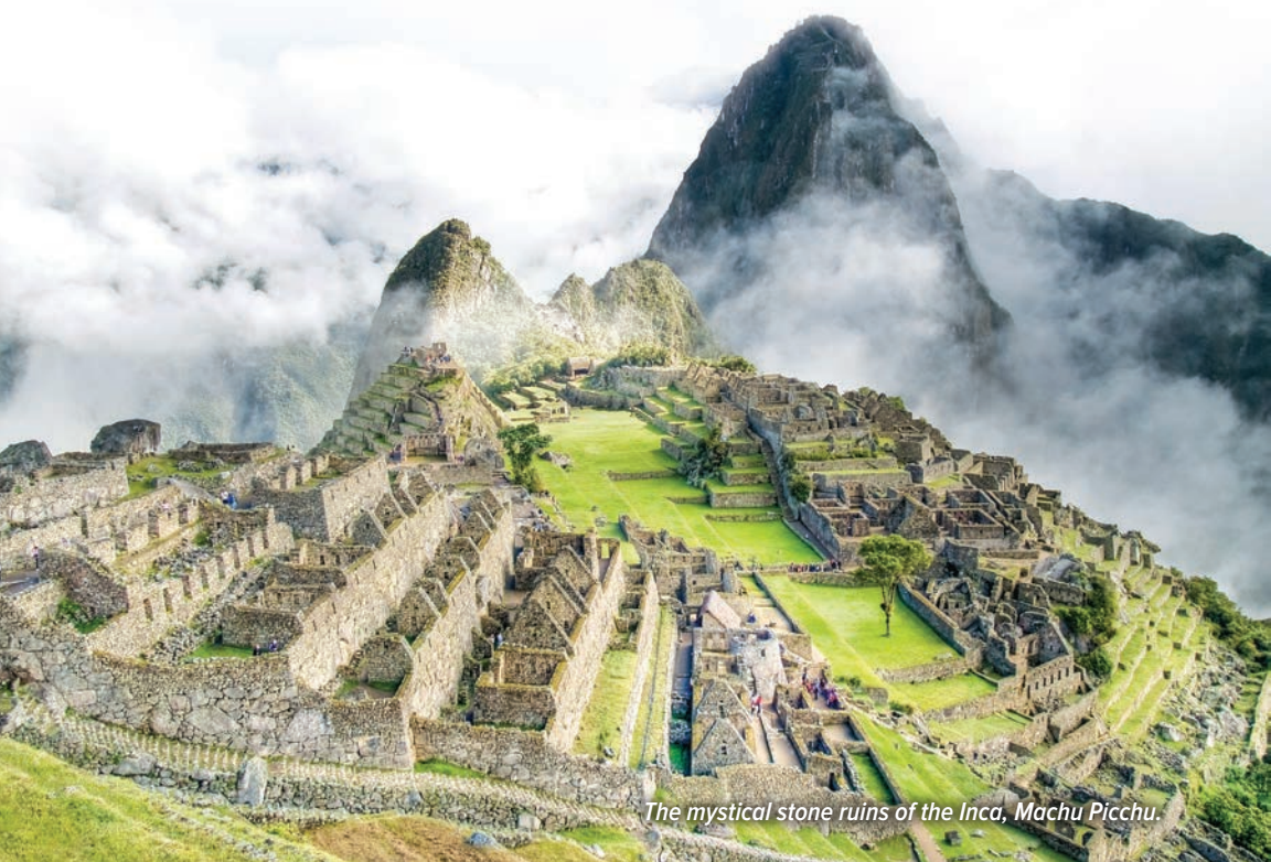
The mystical stone ruins of the Inca, Machu Picchu.

16 DAYS/15 NIGHTS—ABOARD NATIONAL GEOGRAPHIC ENDEAVOUR II + LAND EXCURSION