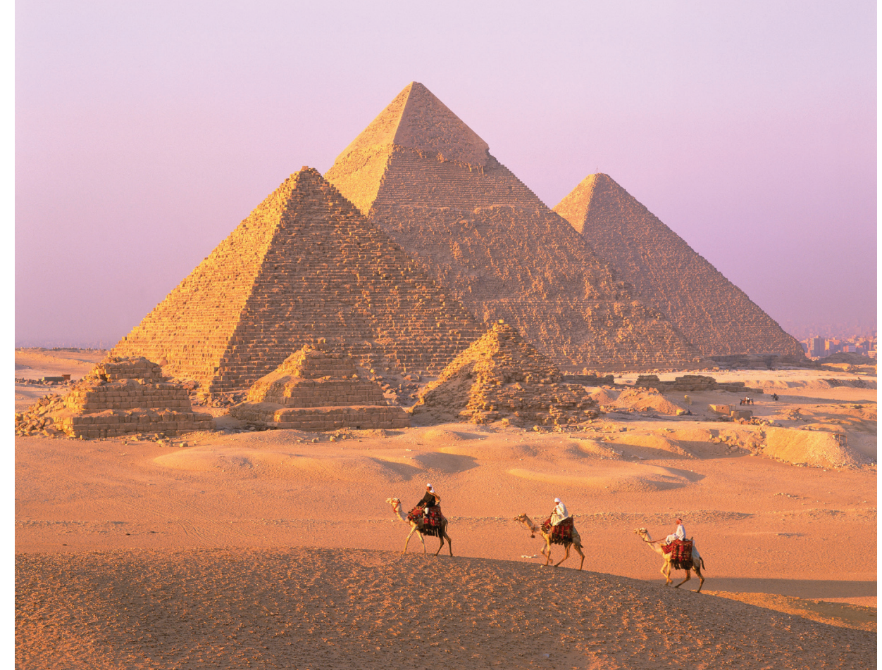
On Day 13 we travel to the Giza plateau to see the legendary pyramids, built 5,000 years ago as royal tombs.

Ratings are based on the Hotel & Travel Index, the travel industry standard reference.