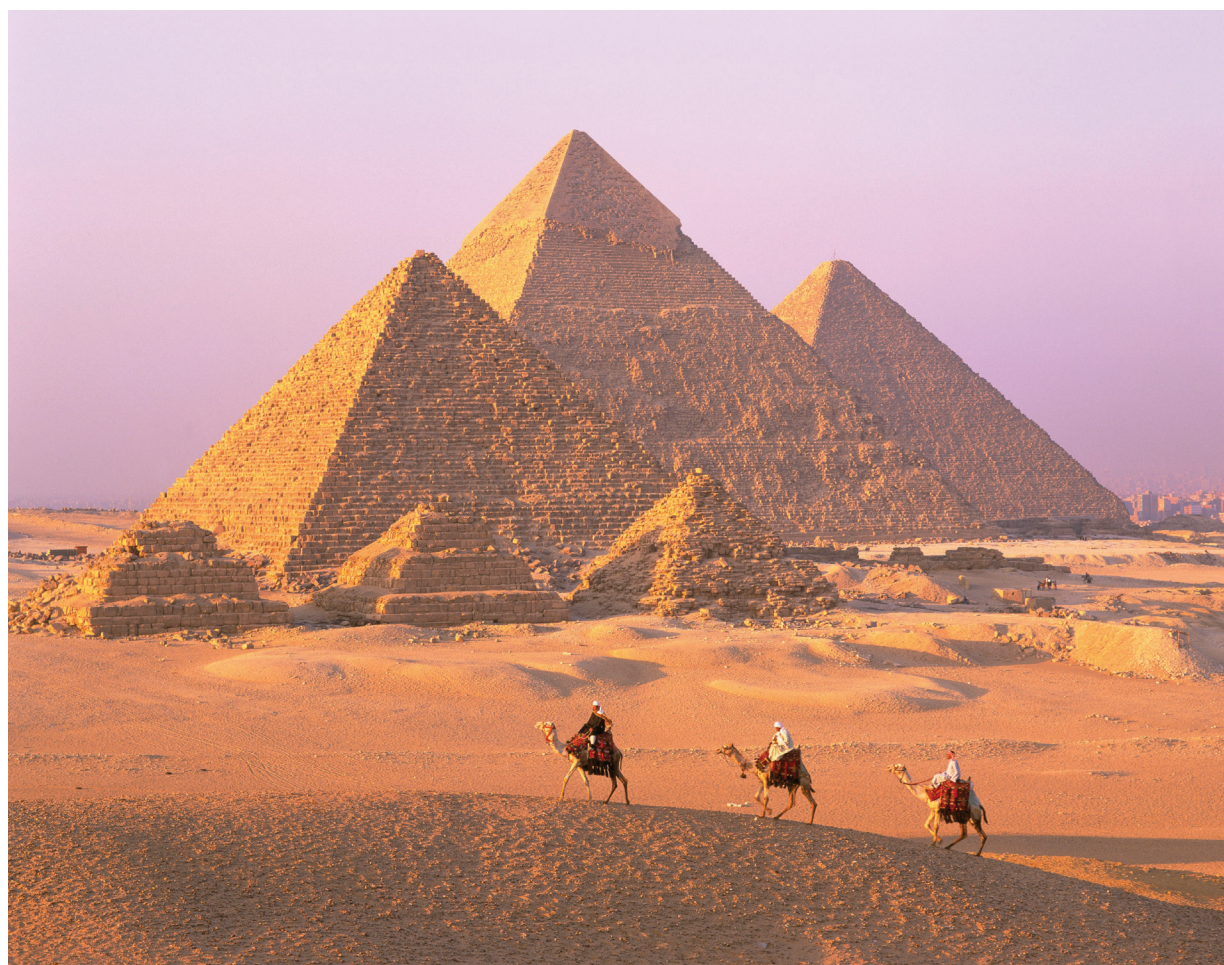
On Day 13 we travel to the Giza plateau to see the legendary pyramids, built 5,000 years ago as royal tombs.