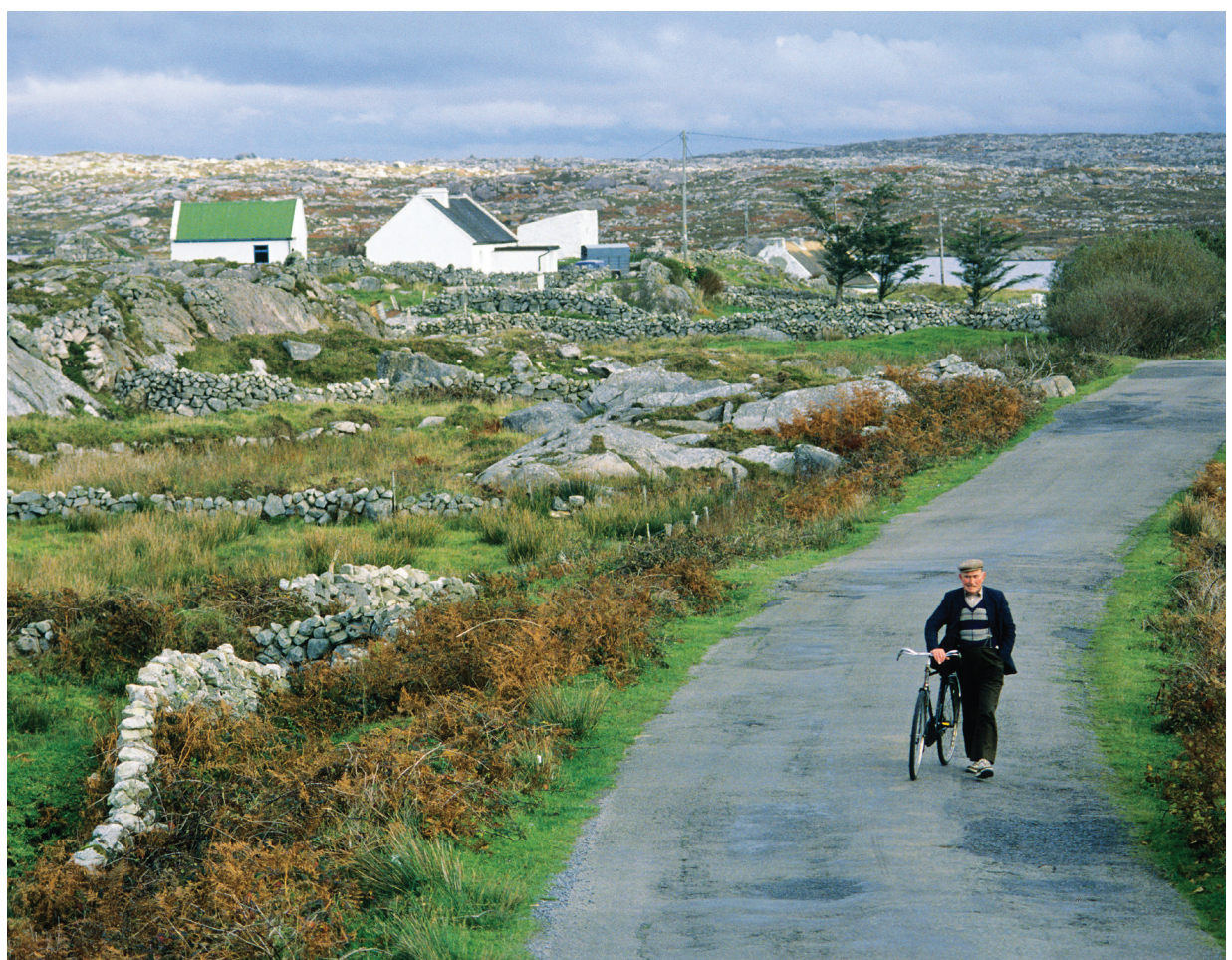
Rural scene in the Connemara, which we explore on Day 5.

Ratings are based on the Hotel & Travel Index, the travel industry standard reference.