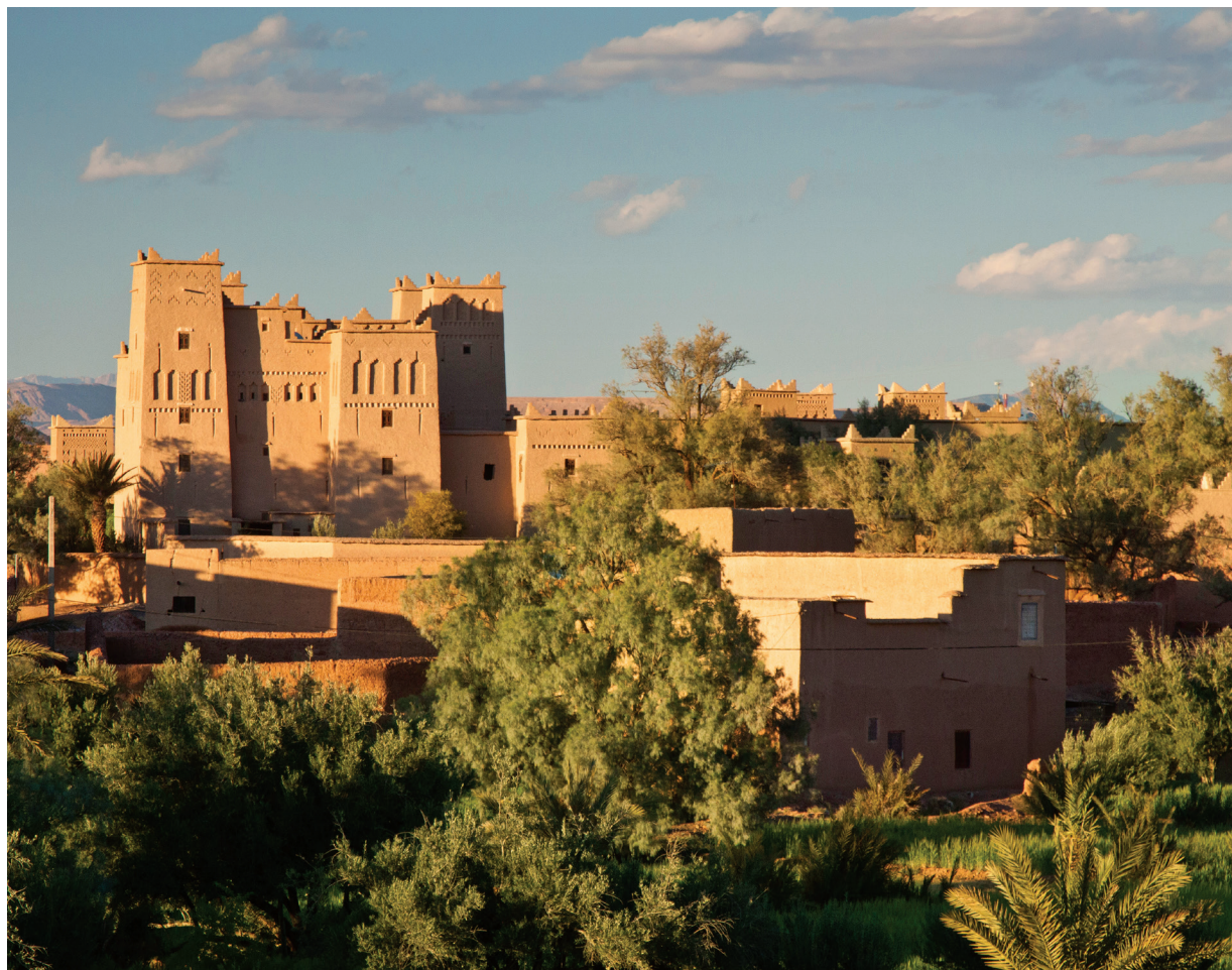
We encounter many of Morocco's age-old kasbahs on our journey.

This land of dramatic contrasts invites us to encounter its ancient ruins and sacred mosques, endless desert and storied mountains, imposing kasbahs and spirited souks. As we travel from the imperial cities of Rabat, Fez, and Marrakech to the High Atlas and vast Sahara, we open our eyes, and hearts, to a truly foreign land, an age-old culture, and genuinely hospitable people.