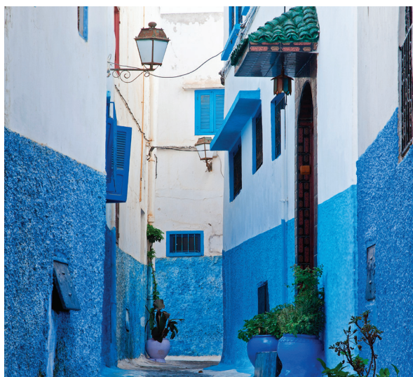
Rabat's Kasbah des Oudaias

Day 8: Erfoud/Rissani/Merzouga This morning we visit the city of Rissani, with its 18 th -century ksar , a virtually impenetrable warren of alleys. We enjoy a tour highlight this afternoon as we set out on a sunset excursion to the breathtakingly beautiful sand dunes at Merzouga on the edge of the Sahara. In the enormous silence we watch the sun set over the desert as we take a camel ride along the erg . Following this experience, we'll have dinner together in this desert setting before returning to our hotel tonight. B,L,D