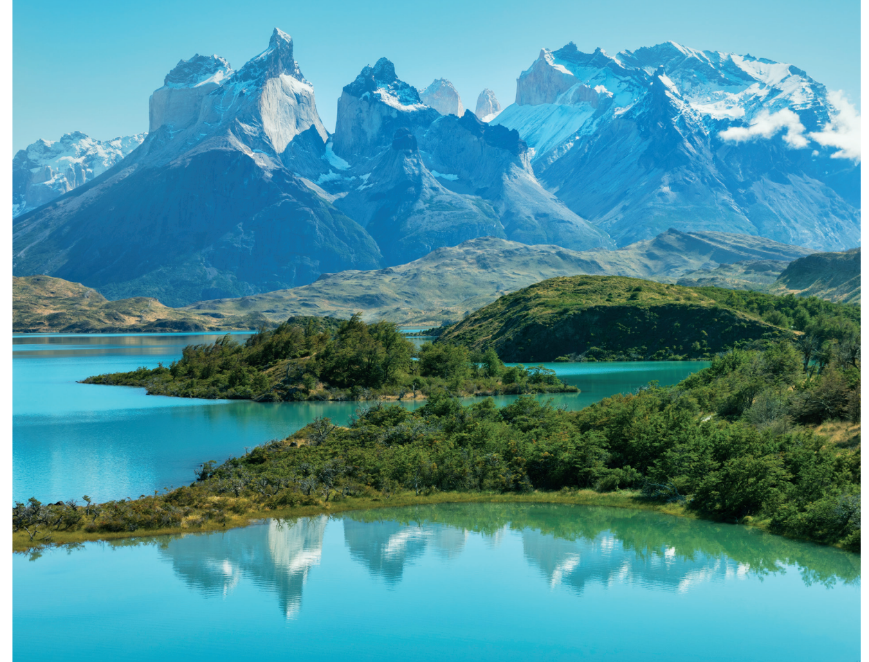
We spend two days exploring unspoiled Torres del Paine National Park. Above: the horn-shaped Cuernos del Paine.

Ratings are based on the Hotel & Travel Index, the travel industry standard reference.