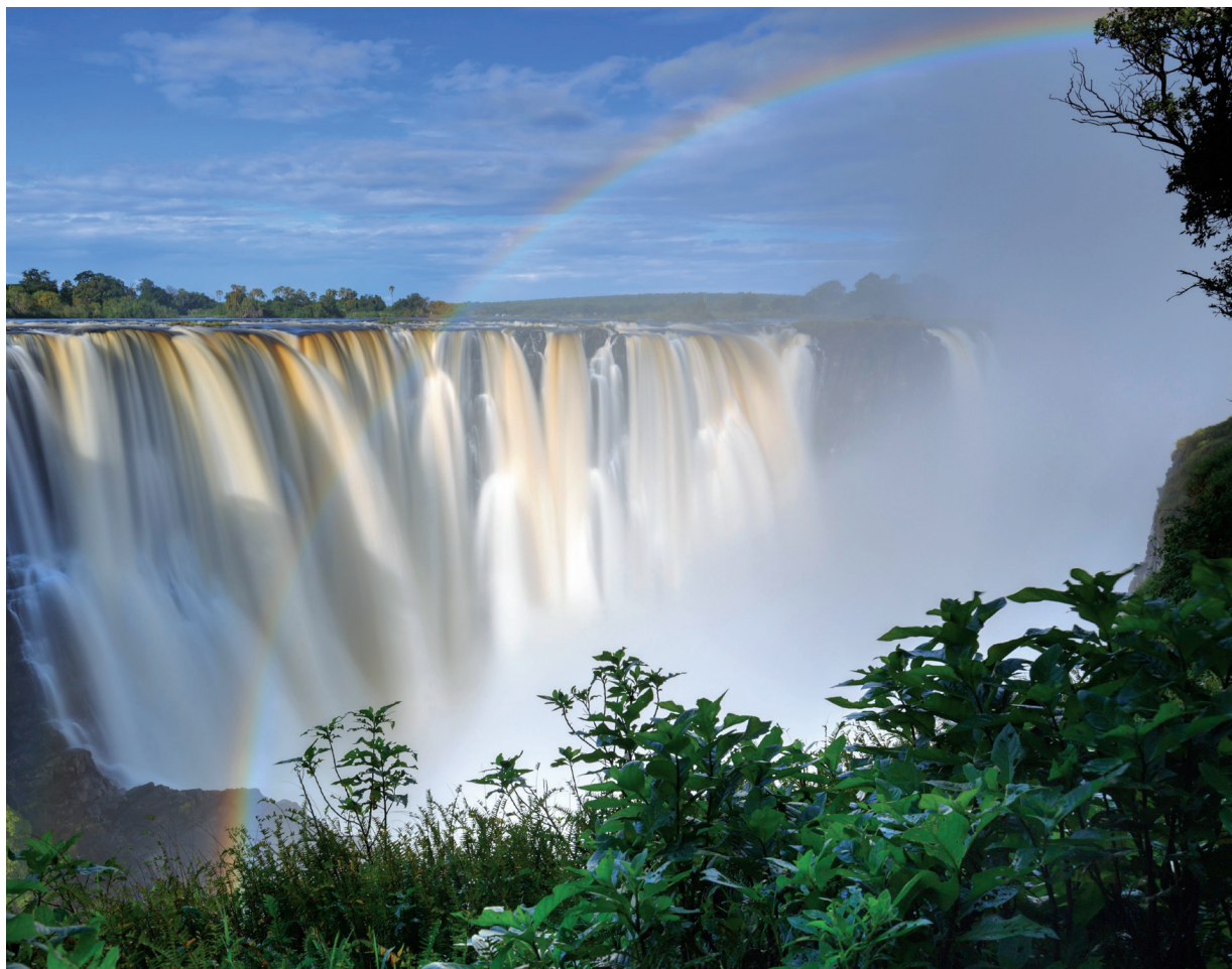
Spanning the width of the Zambezi River, Victoria Falls is the world's largest waterfall.