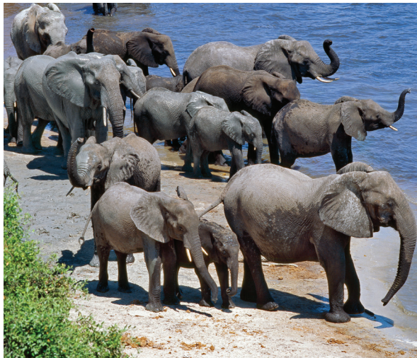
Elephants abound at Chobe.

Day 12: Swakopmund/Walvis Bay/ Namibian Coast From Walvis Bay this morning, we take a cruise along the storied Namibian coast, getting a mariner's