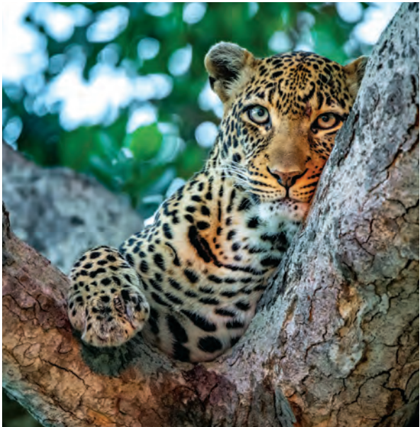
Leopard in the Serengeti

Duke Travels strives to engage Duke faculty or senior leaders and hosts as leaders on all their programs to augment the educational experience and provide a uniquely Duke perspective. Visit duke-travels.com for updates.