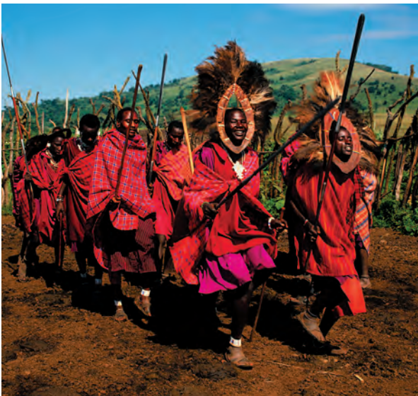
Kenya's native Maasai people

Day 16: Arrive U.S. We reach the U.S. today and connect with our flights home.