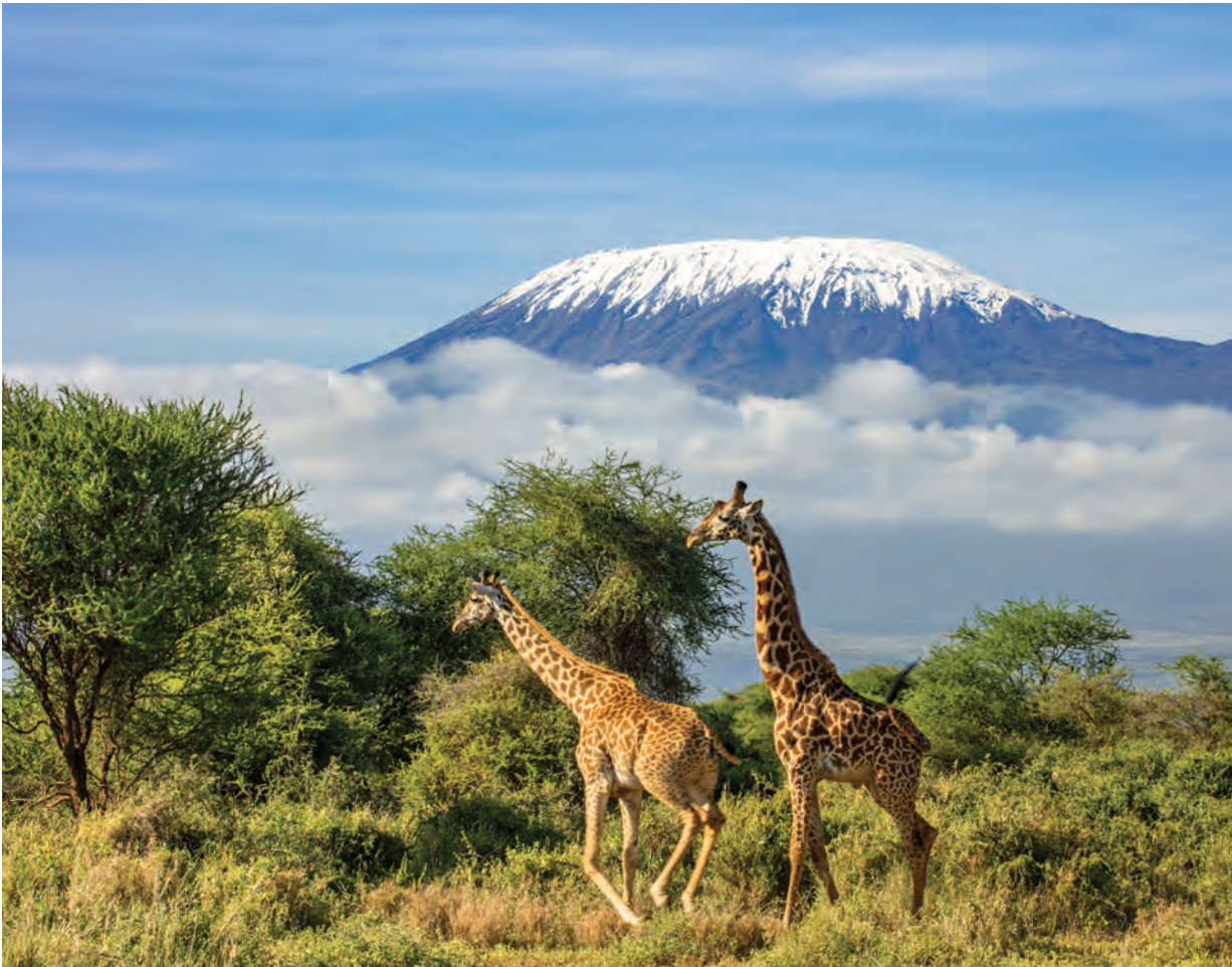
Giraffe roam Amboseli National Park in the shadow of Mt. Kilimanjaro.