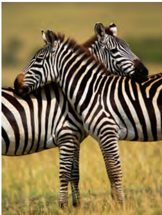
We're sure to see zebra.

Day 11: Serengeti/Masai Mara We leave Tanzania today, crossing into Kenya and continuing on to Masai Mara by air. Kenya's premier wildlife reserve rich with animal life, the Mara is the traditional homeland of the Indigenous Maasai people. Known especially for the