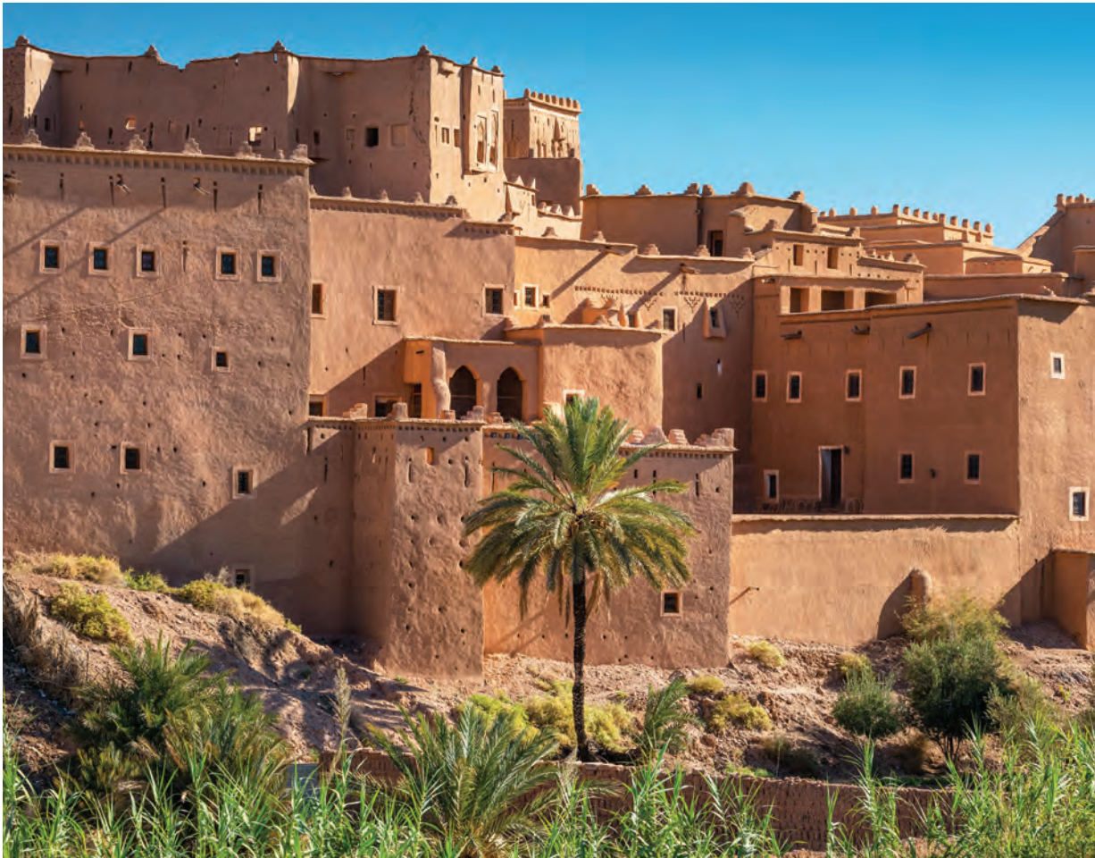
We travel the “Route of a Thousand Kasbahs” ancient caravan trail during our journey.

Day 2: Arrive Rabat Upon arrival this afternoon in Rabat, we transfer by coach to our hotel located near famed Hassan Tower. We have time to relax and refresh before dinner tonight at the hotel. D