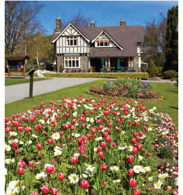
We tour Christchurch's Botanic Gardens on Day 10.

Duke Travels strives to engage Duke faculty or senior leaders and hosts as leaders on all their programs to augment the educational experience and provide a uniquely Duke perspective. Visit duke-travels.com for updates.