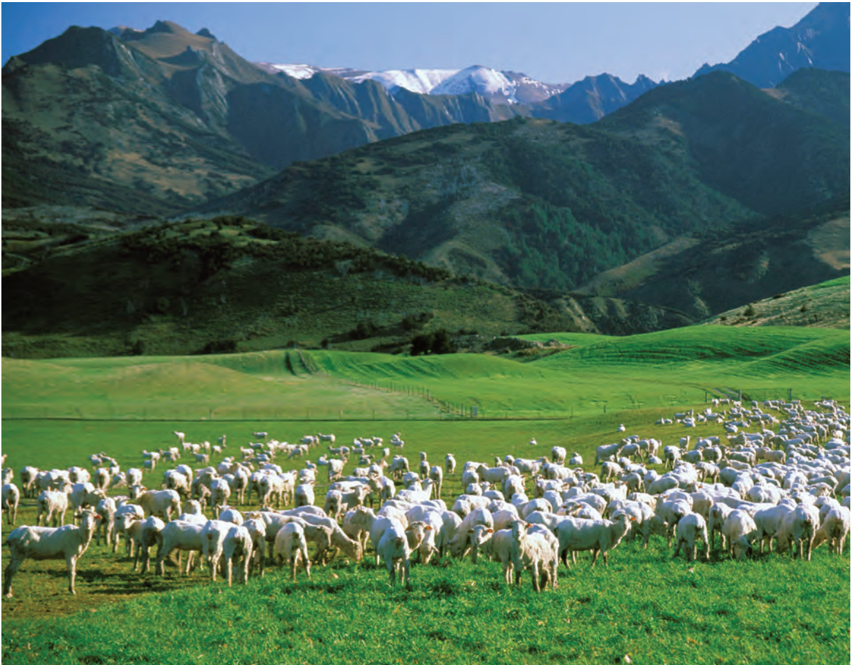
Grazing in the grass: New Zealand boasts more sheep than people – and stunning vistas at every turn.