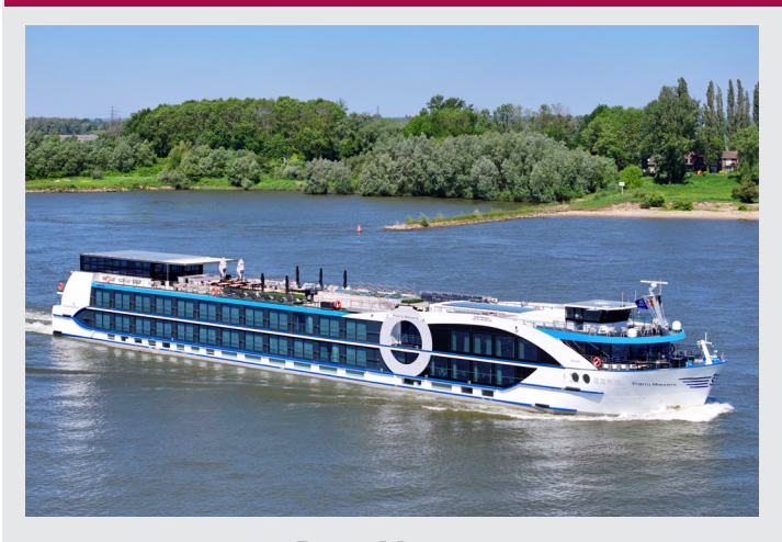
Porto Mirante Exclusively Chartered, Deluxe River Boat