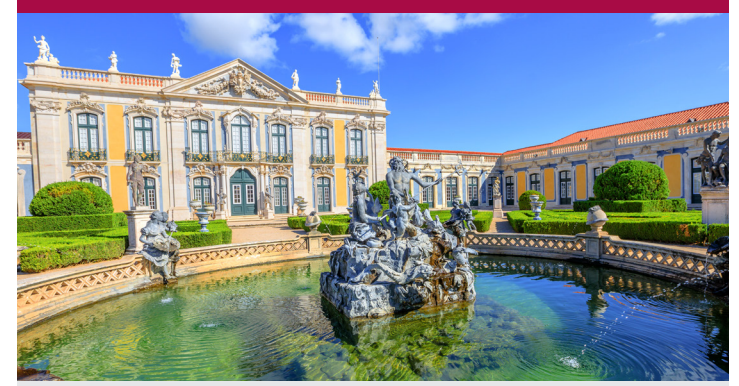
Lisbon | 4 days, 3 nights October 25 to 28, 2026 | Program Begins: October 26