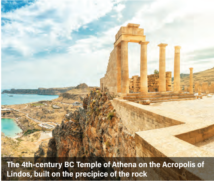
The 4th-century BC Temple of Athena on the Acropolis of Lindos, built on the precipice of the rock

vehicle-free area where brightly colored neoclassical houses line the waterfront, and where the Church of Agios Nikolaos boasts a beautiful bell tower and a pebble mosaic courtyard. Explore the nearby abandoned village of Chorio and the medieval castle built by the Knights of St. John. Have lunch at seaside tavern before returning to Rhodes. (B,L,D)