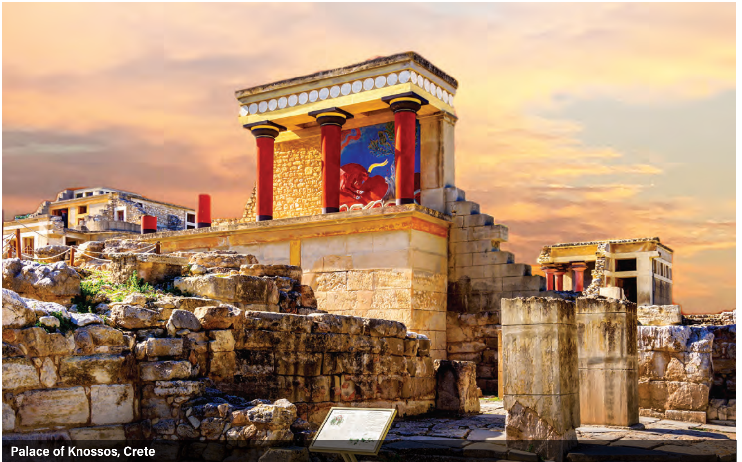
Palace of Knossos, Crete