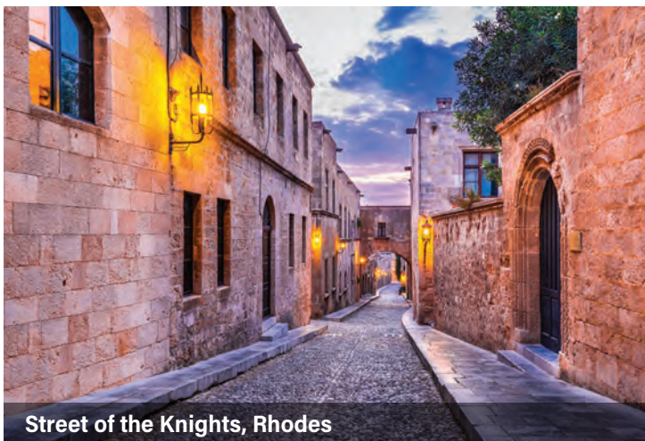
Street of the Knights, Rhodes

Today, travel to the tiny, seldom-visited island of Chalki, just off Rhodes' western coast, to get a sense of the rhythm of life away from major cities and tourist sites. Nimborio, the main harbor, is a