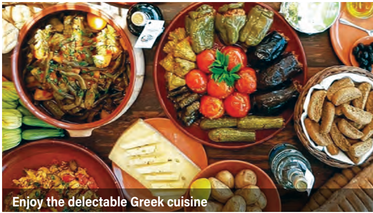
Enjoy the delectable Greek cuisine