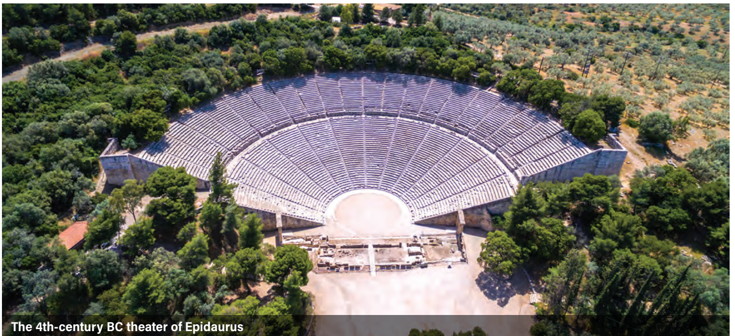
The 4th-century BC theater of Epidauros