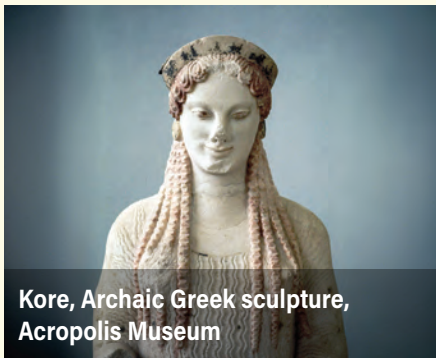
Kore, Archaic Greek sculpture, Acropolis Museum

NOT INCLUDED: International airfare; travel insurance; expenses of a personal nature; any items not mentioned in the Itinerary and the Program Inclusions.