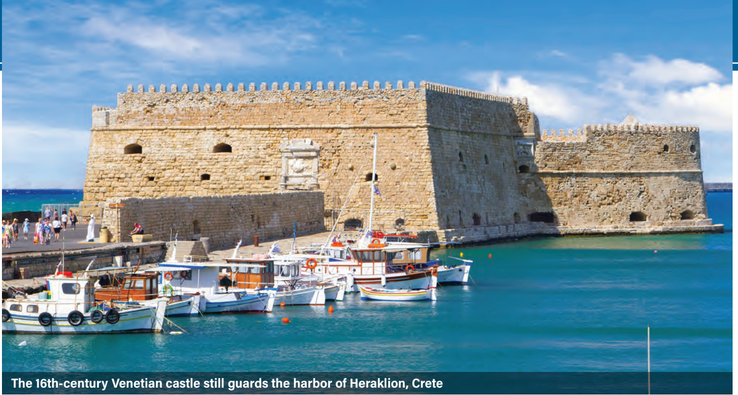
The 16th-century Venetian castle still guards the harbor of Heraklion, Crete