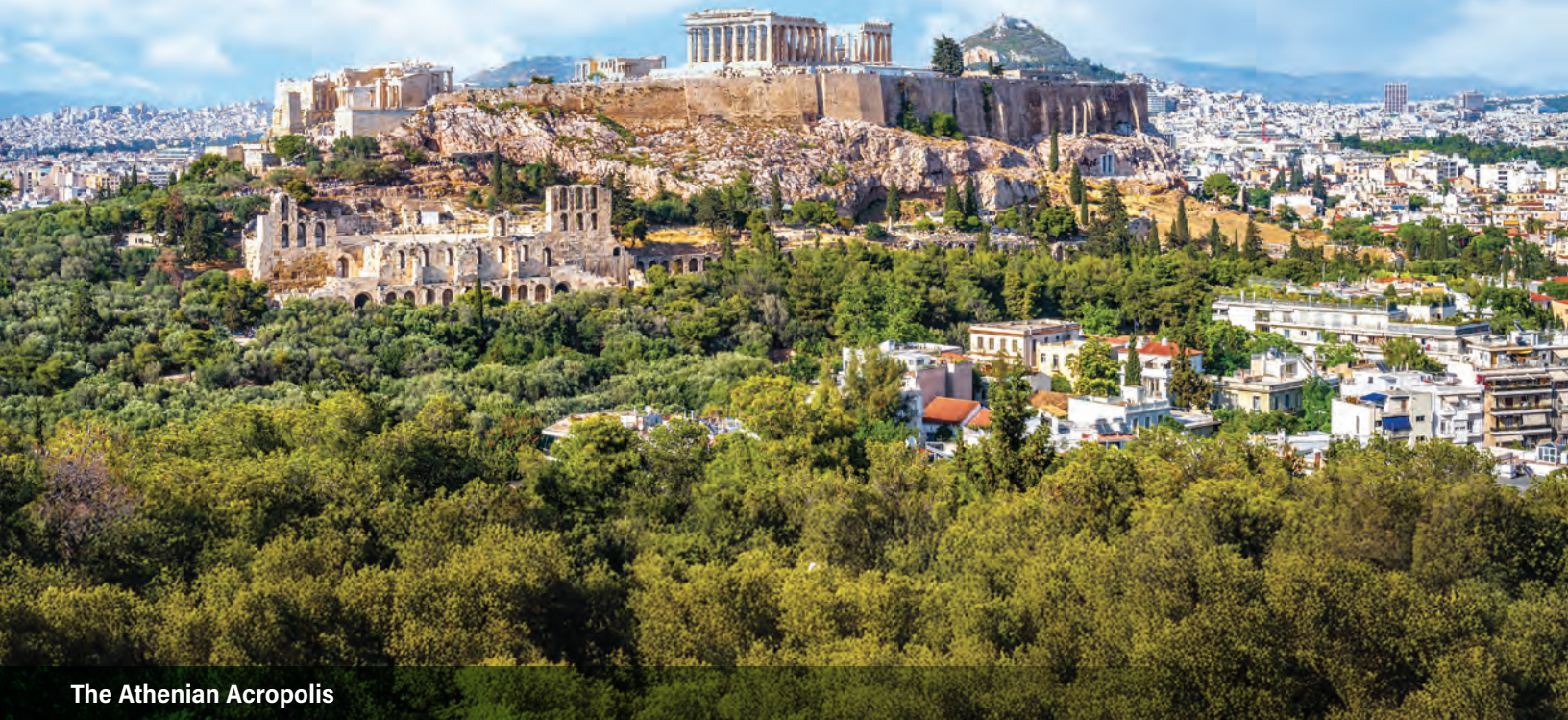
The Athenian Acropolis