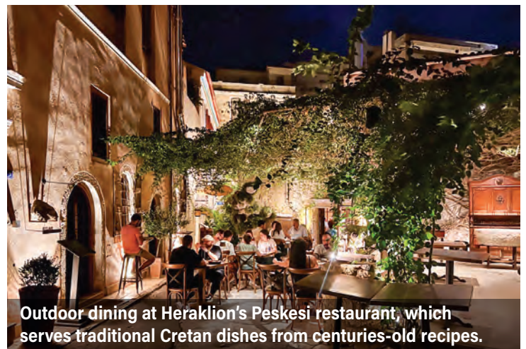
Outdoor dining at Heraklion's Peskesi restaurant, which serves traditional Cretan dishes from centuries-old recipes.

FOR RESERVATIONS AND INFORMATION, PLEASE CONTACT DUKE TRAVELS AT (919) 684-2988