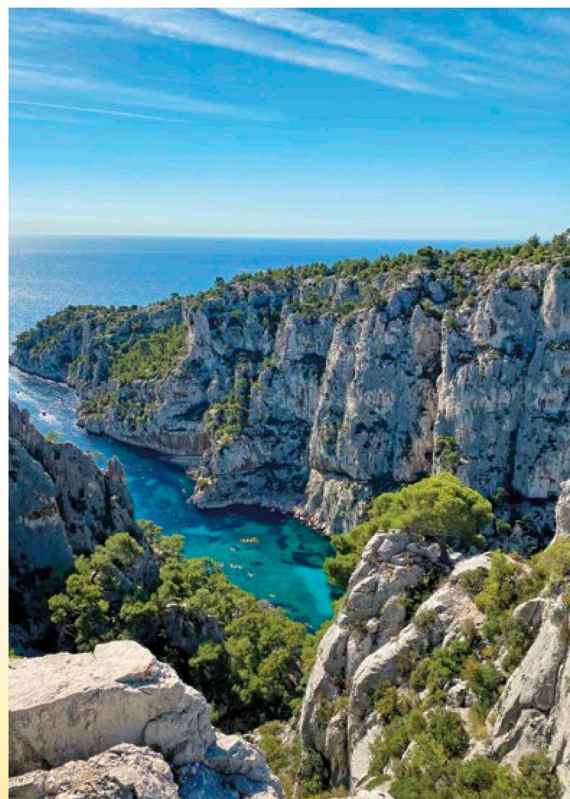
Calanques of Cassis