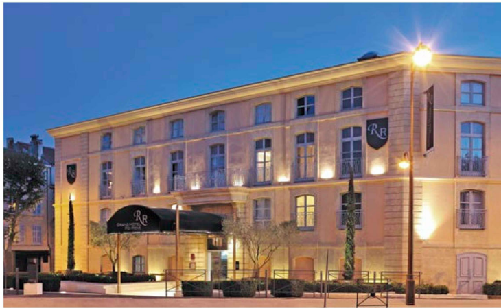
Grand Hotel ROI Rene | Aix-en-Provence, France