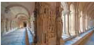
Saint Trophime Cathedral, Arles