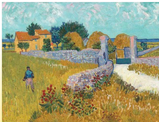
Farmhouse in Provence by Vincent van Gogh, 1888

Les Baux & St. Remy. Delight in visits to two quintessentially Provençal villages. Les Baux, perched atop towering limestone cliffs, offers breathtaking views, a tiny medieval village and ancient fortress. In romantic St. Remy’s, gaze at the lush, perfumed valleys that inspired more than 150 of Van Gogh’s paintings during one of his most artistically fruitful periods. Return to Aix for a festive group dinner tonight.