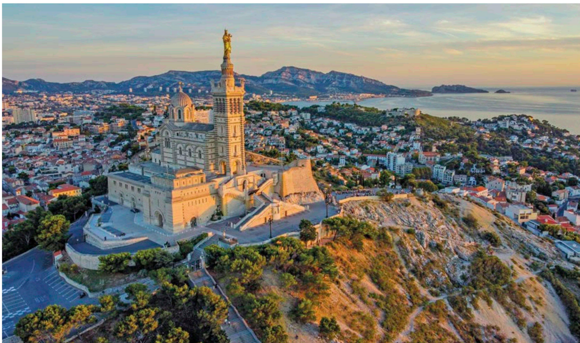
Notre-Dame de la Garde, Marseille