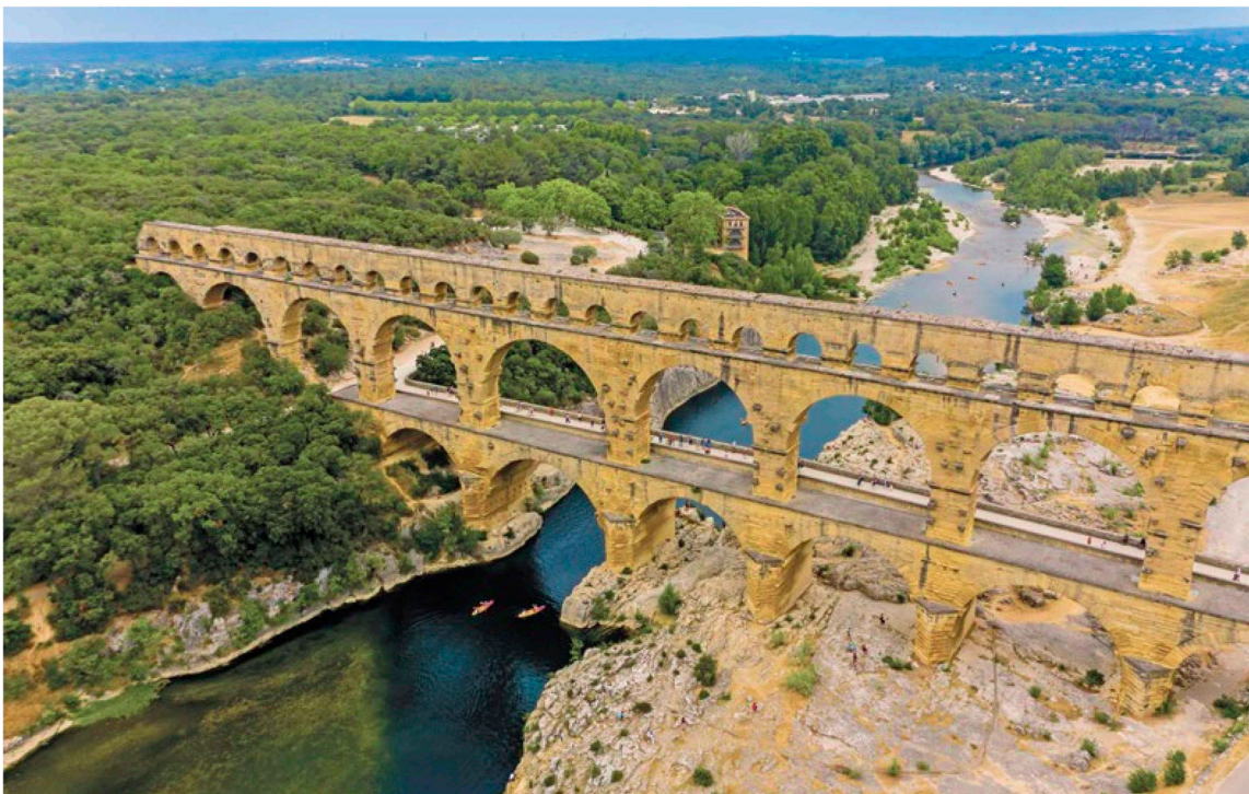
Pont du Gard