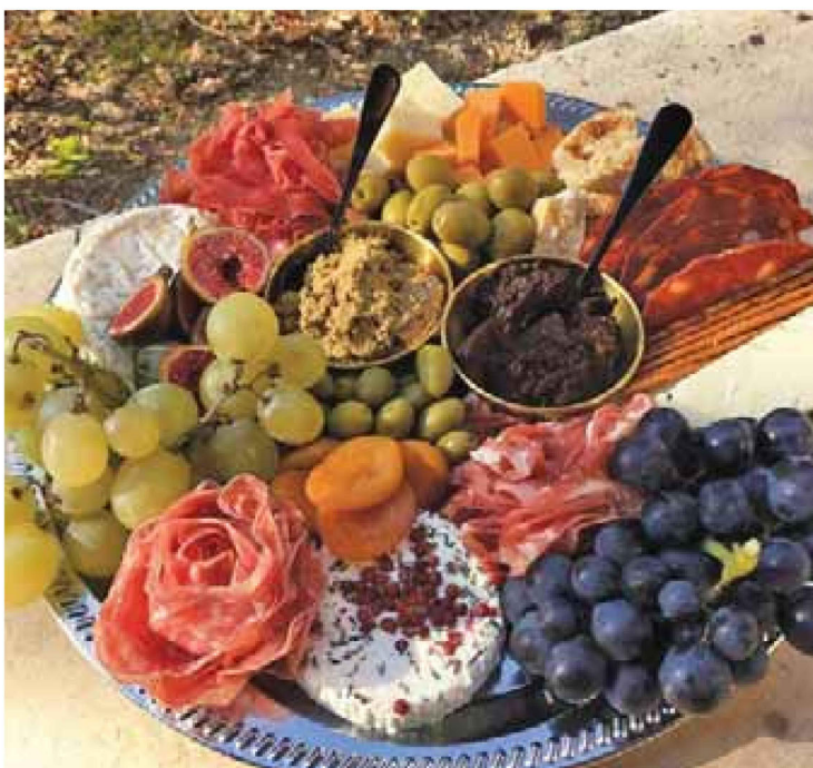
Fresh truffle hors d'oeuvres, Les Pastras