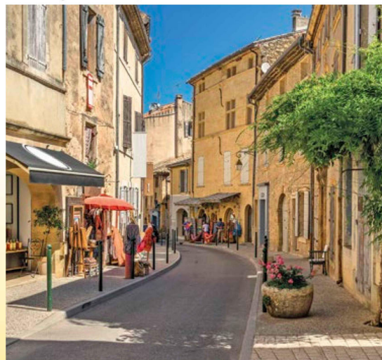
Charming Lourmarin, Luberon

Enrichment. Splendors of Aix-en-Provence & the South of France.