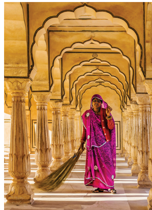
We explore Jaipur’s Amber Fort on Day 6.

Day 17: Return to U.S. Very early this morning we transfer to the airport for our return flight to the U.S.