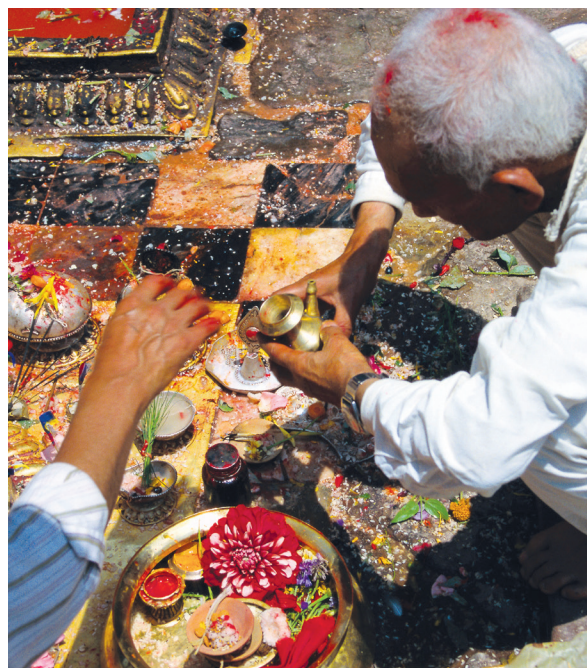
Typical marketplace scene

Day 16: Varanasi/Delhi We fly this afternoon to Delhi, where the evening is at leisure. B