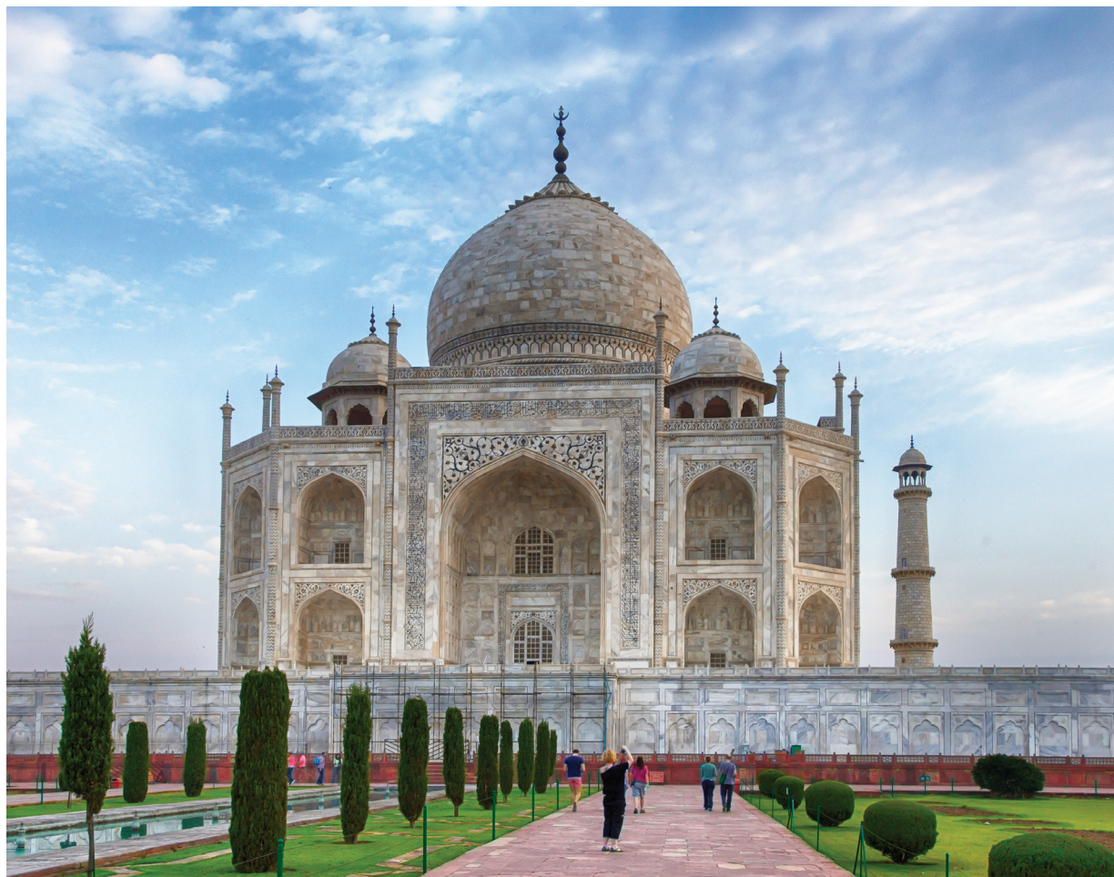
On Day 12 we visit the Taj Mahal, a UNESCO site considered one of the world's most beautiful buildings.