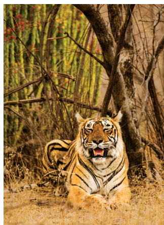
Bengal tiger rests in Ranthambore.

Day 11: Gadoli/Agra En route to Agra, we stop in the ancient village of Abhaneri to see the fortified Chand Baori step well (c. 800 CE), whose 3,500 steps descend some 13 stories into the ground. Continuing on, we reach the ancient Mughal stronghold of Agra,