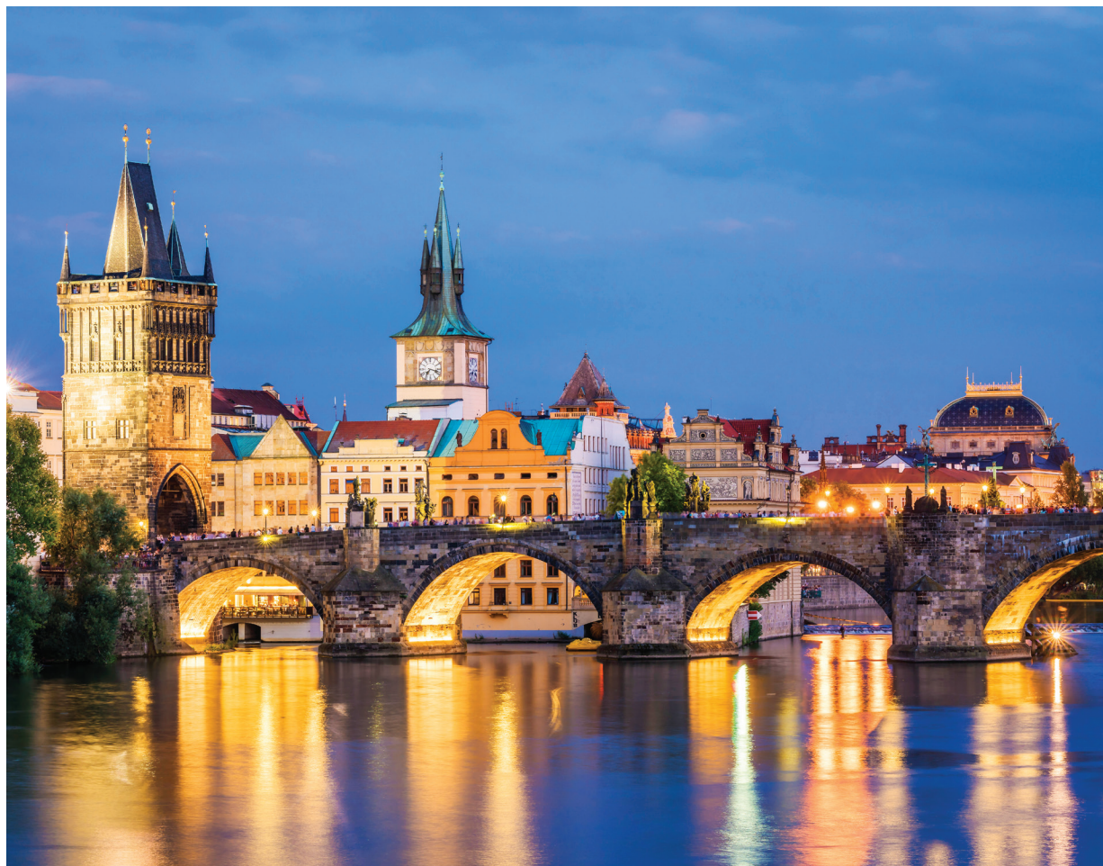
Nighttime view of Prague's Charles Bridge, which connects Old Town with Prague Castle