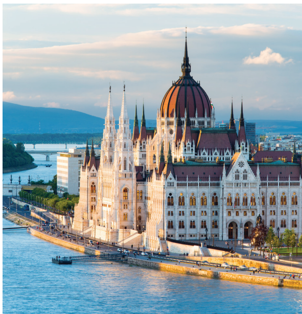
Budapest's Gothic Parliament sits on the Danube.

This morning, we visit the Dohány Synagogue with its rich but tragic history. Built in 1859, it is the largest synagogue in Europe and the world's second largest. We're free to discover the "Paris of the East" on our own today. With splendid architecture, a lively café culture,