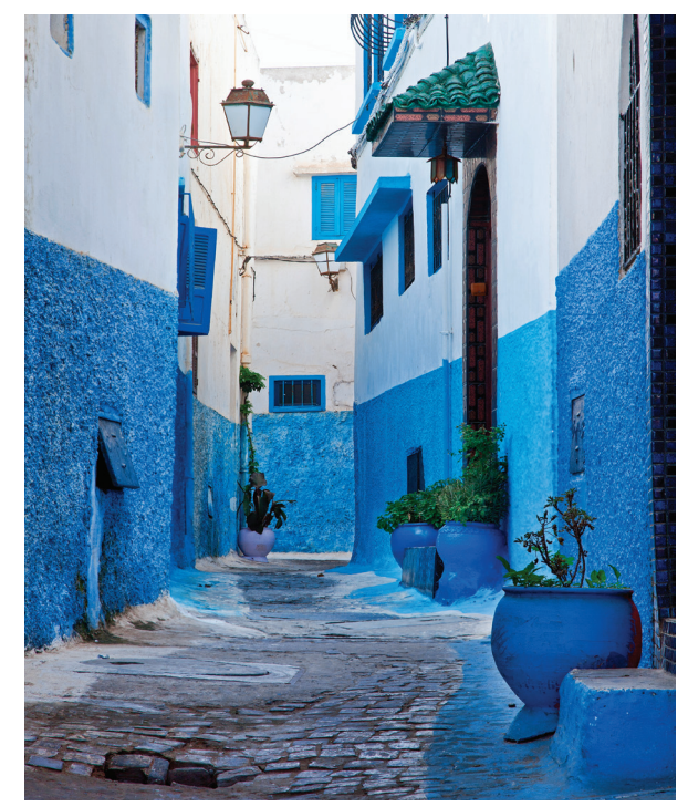
Rabat's Kasbah des Oudaias

Day 8: Erfoud/Rissani/Merzouga This morning we visit the city of Rissani, with its 18^{th} -century ksar , a virtually impenetrable warren of alleys. We enjoy a tour highlight this afternoon as we set out on a sunset excursion to the breathtakingly beautiful sand dunes at Merzouga on the edge of the Sahara. In the enormous silence we watch the sun set over the desert as we take a camel ride along the erg . Following this experience, we'll have dinner together in this desert setting before returning to our hotel tonight. B, L, D