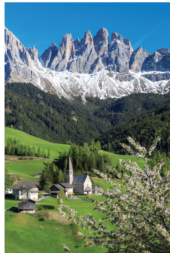
We enjoy stunning Dolomites scenery in the South Tyrol.

This morning we take a guided walk through vast St. Mark's Square. The afternoon is free for independent exploration; tonight we bid “ arrivederci ” to Italy and to our fellow travelers at a farewell dinner. B,D