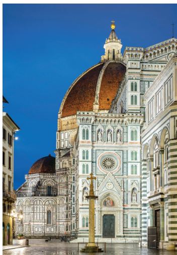
Florence's Duomo and Baptistery

We spend today touring and exploring wondrous Florence, a living monument to the Renaissance and crown jewel of Tuscany. Our day includes a guided morning walking tour followed by free time. Together we visit the Galleria dell'Accademia to view Michelangelo's sublime David and his pieces for the papal tombs; and the Duomo , with its stupendous dome by Brunelleschi. Then we're free to stroll the 14 th -century Ponte Vecchio, with its many jewelry shops; visit renowned museums and churches; shop for leather goods and artful Florentine paper; and to enjoy lunch on our own. We return to our hotel in the mid-afternoon. B