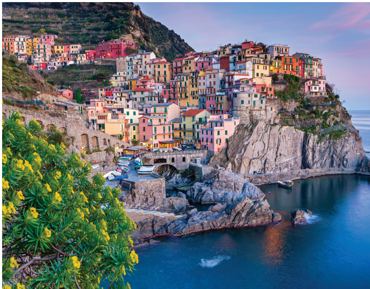
We see Liguria's Cinque Terre, a UNESCO site, by land and sea on Day 7.