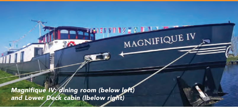
Magnifique IV; dining room (below left) and Lower Deck cabin (below right)

Sailing under the Dutch flag, this new river vessel has 10 generous suites on the upper deck, while the lower deck has eight twin cabins. Magnifique IV 's upper deck features a spacious and tastefully decorated salon with air conditioning, a bar, and lounge area. Wi-Fi is also available. The comfortable and inviting restaurant is separated from the kitchen by a glass wall, so you can watch talented chefs in action. The front deck has space to accommodate bicycles, while the top deck boasts a Jacuzzi and deckchairs, from which you can enjoy the scenery.