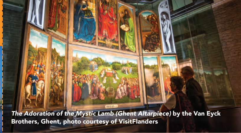
The Adoration of the Mystic Lamb (Ghent Altarpiece) by the Van Eyck Brothers, Ghent