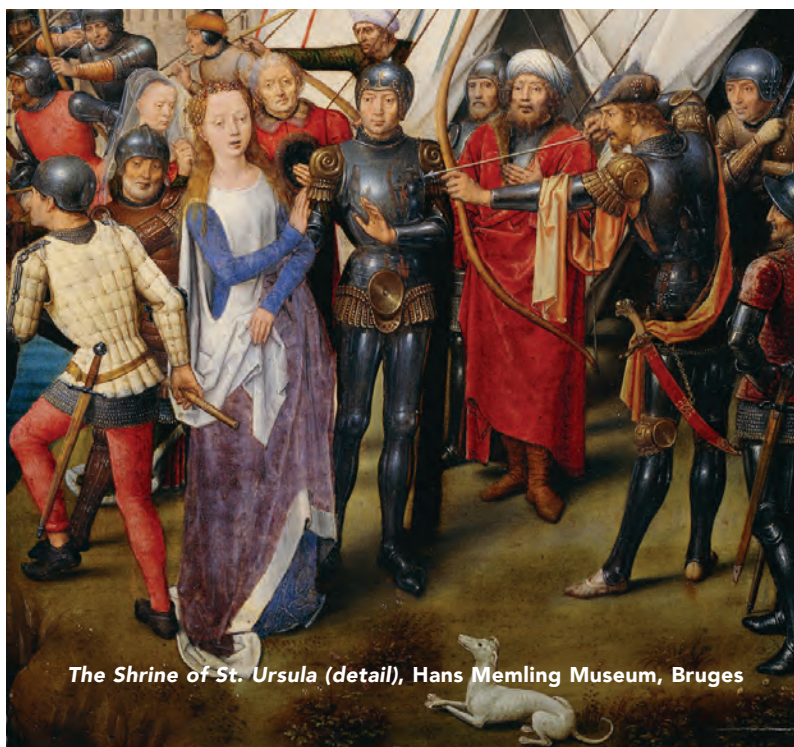
The Shrine of St. Ursula (detail), Hans Memling Museum, Bruges

Today, discover the Groeninge Museum, with works by Jan van Eyck and other great Flemish artists. Visit a local artist and enjoy a tour at the Adornes Domain, an authentic medieval estate in the heart of Bruges, followed by light refreshments ( pending confirmation ). This afternoon, travel to Ghent, where a guided walking tour will reveal the fascinating history of this lively city, including a visit to its Fine Museum of Arts. B,L,D