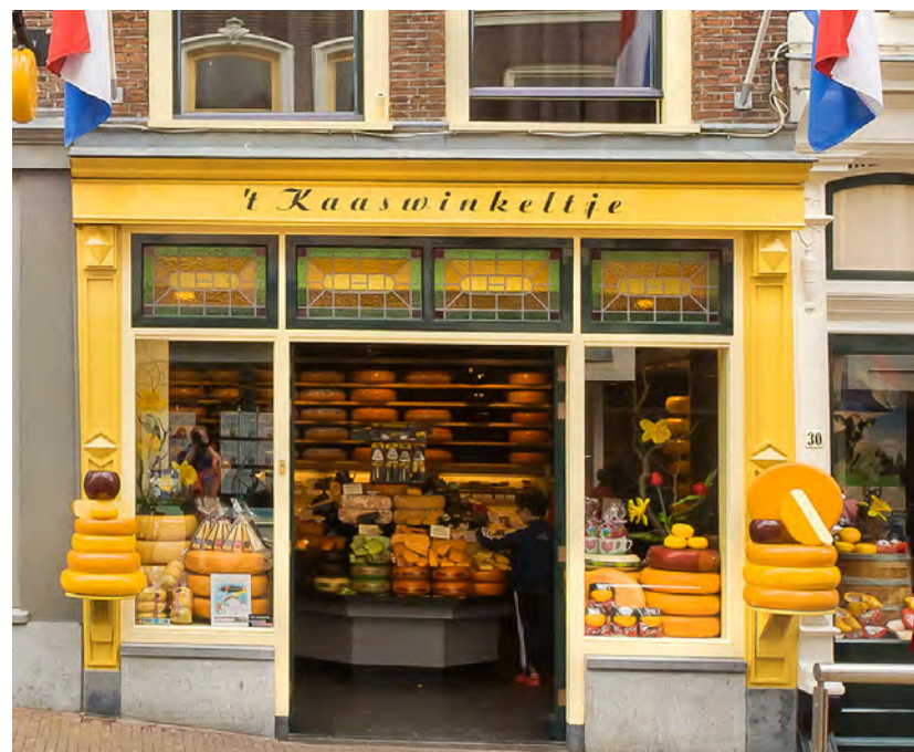
Cheese Shop, Gouda

DISCLAIMER: The itinerary is subject to change at the discretion of Duke Travels and Arrangements Abroad. For complete details, please carefully read the terms and conditions at http://www.arrangementsabroad.com/terms