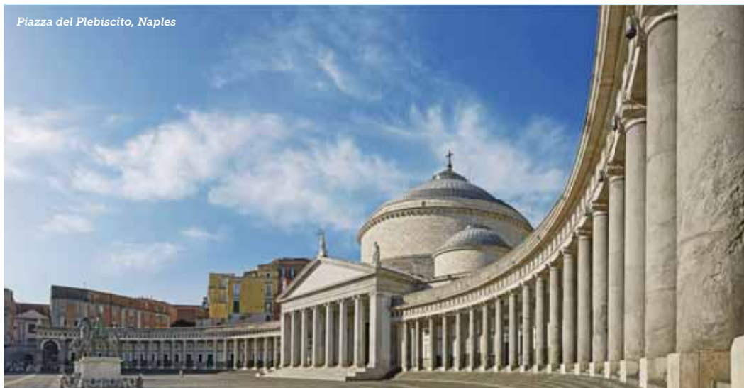
Piazza del Plebiscito, Naples