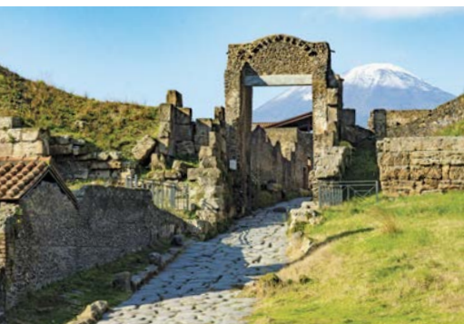
Pompeii and Mount Vesuvius

Uncover the superlative power of Mount Vesuvius while exploring Herculaneum and Pompeii, villages that were destroyed in the