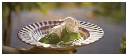
Top: Bay of Sorrento | Above: Olive oil and cheese

Continue your culinary discovery of Italy's mouthwatering dishes and heirloom recipes over a group dinner.