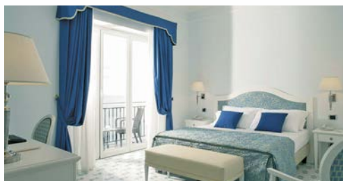
Hotel Raito guest room