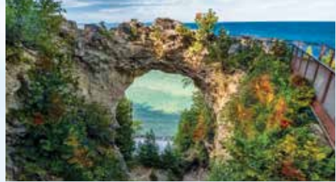
Discover the natural limestone of Arch Rock, rising 146 feet over Mackinac Island.

Photo this page: The landmark GRAND HOTEL opened in 1887 as a summer retreat for vacationers who came to Mackinac Island via steamer and boat.