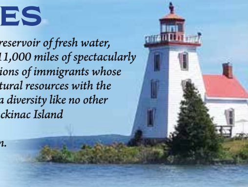
See remote lighthouses built with a square wooden tower for greater comfort for the keeper.

I n the heart of North America lies the world's largest reservoir of fresh water, carved by glaciers 10,000 years ago. Surrounded by 11,000 miles of spectacularly sculpted shoreline, the five Great Lakes inspired generations of immigrants whose contributions irrevocably changed the world. Rich in natural resources with the benefits of four seasons, the Great Lakes region provides a diversity like no other place on Earth. Experience the best of Americana on Mackinac Island and in Sault Sainte Marie, admire a revitalized Detroit and visit the Henry Ford Museum of American Innovation. Explore the maritime heritage and spirit of innovation that inextricably altered the face of transportation and the course of World War II. Enjoy unspoiled natural beauty, the power of Niagara Falls and stunning sunrises and sunsets while exploring North America's Great Lakes.