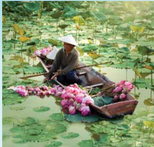
The lotus is one of Buddhism's most sacred flowers, blooming from muddy waters each morning.

Visit a local workshop which provides training for thousands of Cambodians to perpetuate the creation of their traditional, cultural handcrafts.