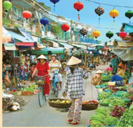
Experience Vietnam's kaleidoscopic markets, a vivid nexus of history, culture and commerce.

colorful riverside market and admire the graceful arc of the Lai Vien Keiu Bridge, originally built in 1590.