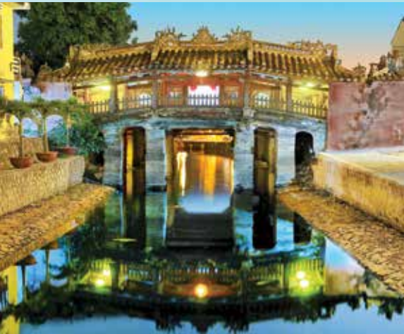
Admire the ornate, Lai Vien Kieu Bridge, built to link Hoi An's Chinese and Japanese quarters.

Near Siem Reap, the Temple of Angkor Wat is the largest religious structure in the world, built in the 12 th century by King Suryavarman II to honor the Hindu god Vishnu. Angkor Wat