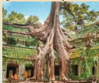
Roots cleave stones and lichen sprouts from delicately carved reliefs at the striking Angkor temple of Ta Prohm.

Encircled by the Marble Mountains and clear-blue waters, coastal Da Nang is known for its exquisite Museum of Cham Sculpture, exhibiting the world's largest collection of indigenous Cham sandstone art and statues dating from the fifth to 15 th centuries.