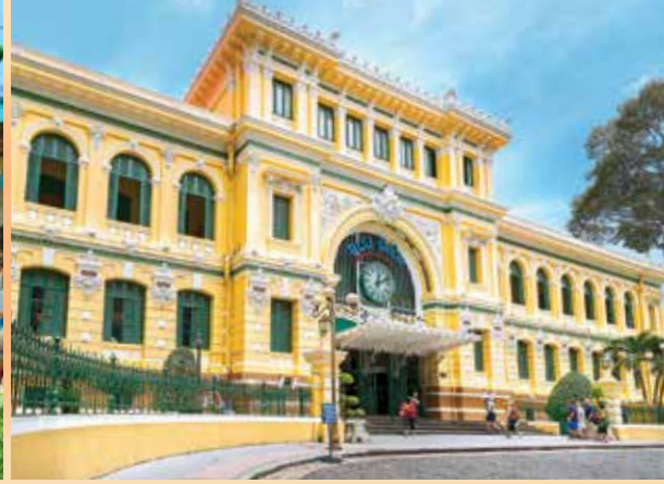
View Saigon's stunning, Neoclassical Central Post Office, built by Cochinchina's chief architect, Marie-Alfred Foulhoux, in 1891.

stands in testament to the centuries-long grandeur of the prosperous Khmer Empire.