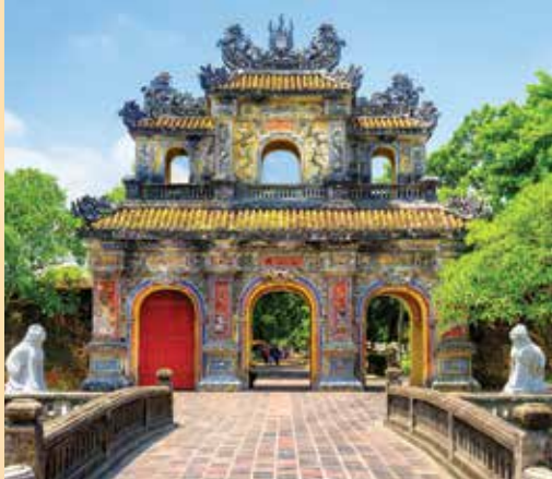
Pass through the Hien Nhon Gate, one of the fortified entrances into Hue's Imperial Citadel.

Nearby, the 11 th -century One Pillar Pagoda is one of Vietnam's most iconic temples, designed to resemble a lotus blossom.