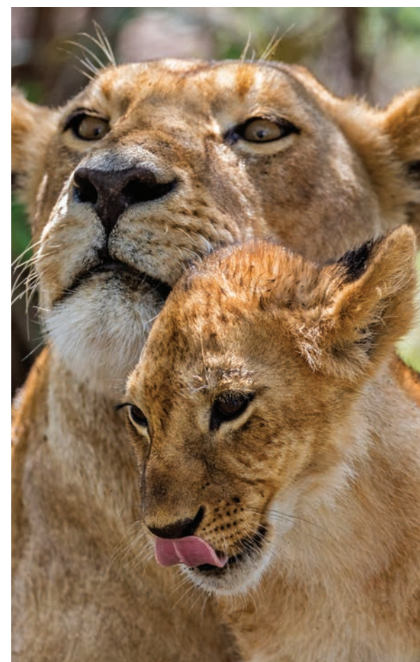
The Serengeti boasts Africa’s largest lion population.