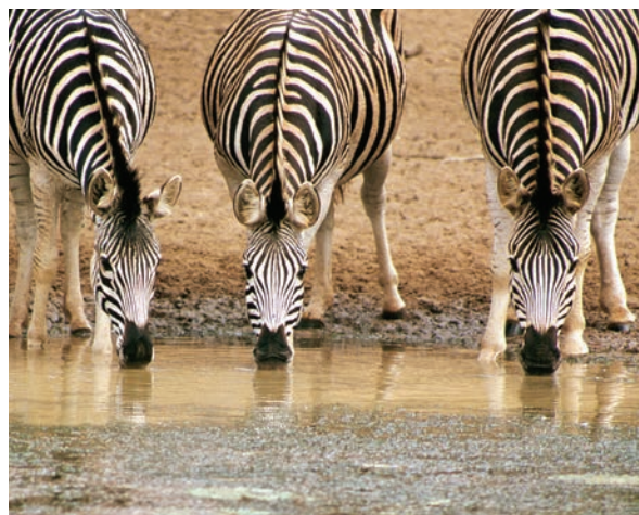
Zebra roam freely in the Masai Mara.

Day 16: Arrive U.S. We reach the U.S. today and connect with our flights home.