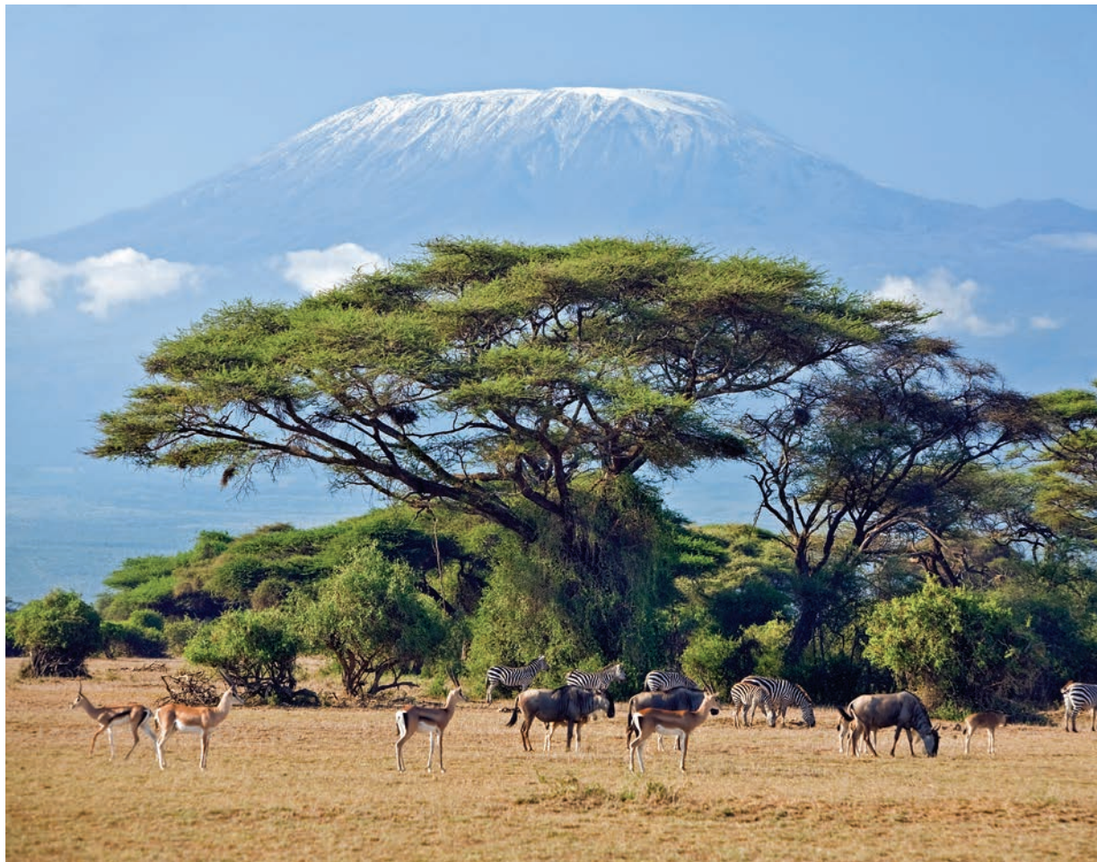
We go on safari in Kenya's Amboseli National Park, in the shadow of Mt. Kilimanjaro.