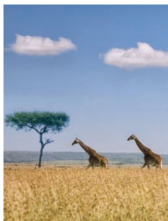
Overlooking the plains ...

Day 11: Serengeti/Masai Mara We leave Tanzania today, crossing into Kenya and continuing on to Masai Mara by air. Kenya’s premier wildlife reserve rich with animal life, the Mara is the traditional homeland of the native Maasai people. Known especially for the