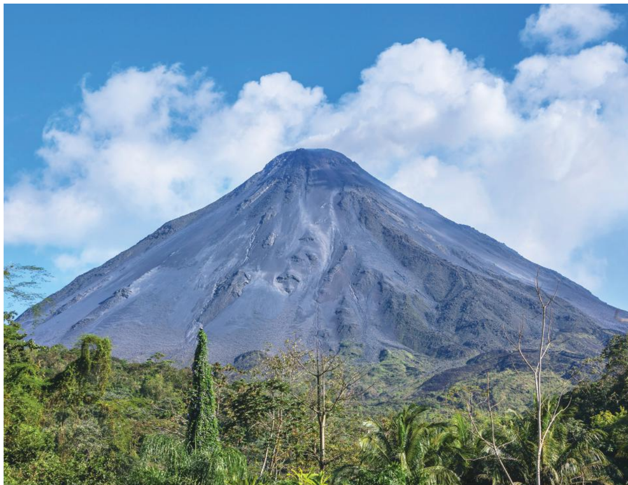
We see Arenal, one of the world's most active volcanoes, from a safe distance.

In this small Central American democracy kissed by nature, our small group discovers a nation's wealth in four distinct regions, from cloud forest to rainforest, Central Valley to Pacific Coast. As Costa Rica presents its staggering display of biodiversity – pristine landscapes, unique microclimates, exotic flora and fauna – we enjoy a relaxed yet comprehensive exploration that celebrates Costa Rica's wide-ranging natural resources.