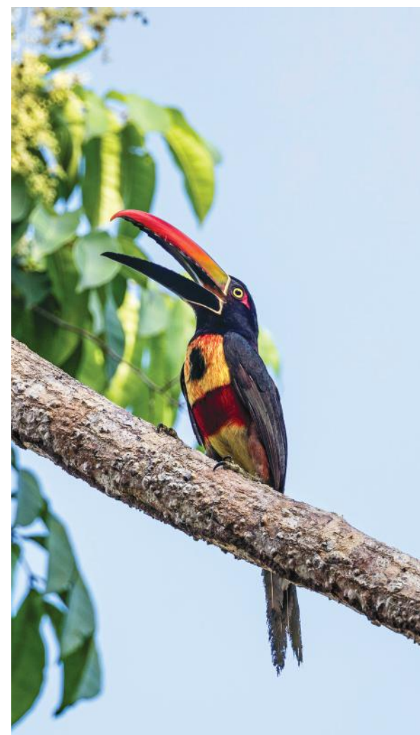
Fiery-billed aracari, a type of toucan