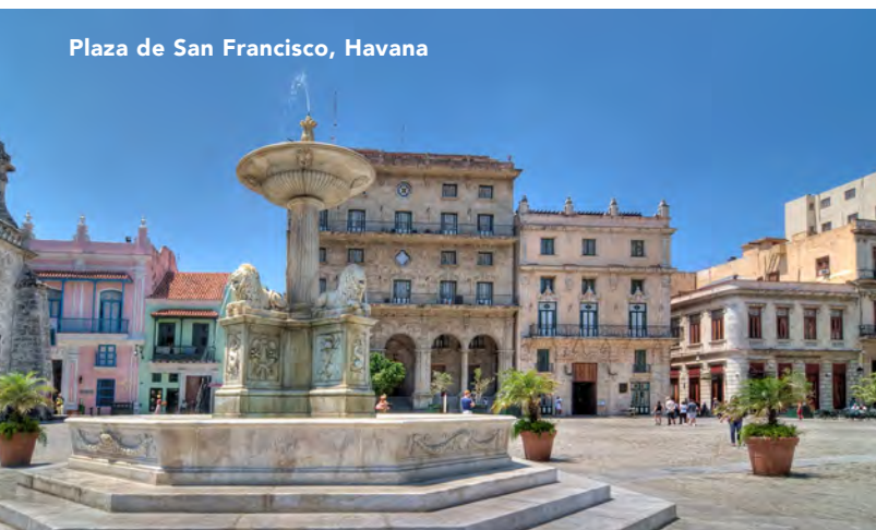
Plaza de San Francisco, Havana

Join a local architectural historian for a lecture on the history of Havana's remarkably well-preserved buildings. Afterwards, depart on a walking tour of Old Havana focusing on the four main squares: the Plaza de Armas, Plaza de San Francisco de Asís, Plaza Vieja, and Plaza de la Catedral. Following lunch at a paladar , take a private tour of the splendidly renovated Gran Teatro de La Habana Alicia Alonso, home to the Cuban National Ballet. Explore the homes and studios of some of Havana's leading artists, where there may be an opportunity to purchase paintings and drawings. Dinner is at El Cocinero, followed by an evening of entertainment next door at Fábrica de Arte Cubano (FAC), the city's vibrant multidisciplinary performing and visual arts space. B,L,D