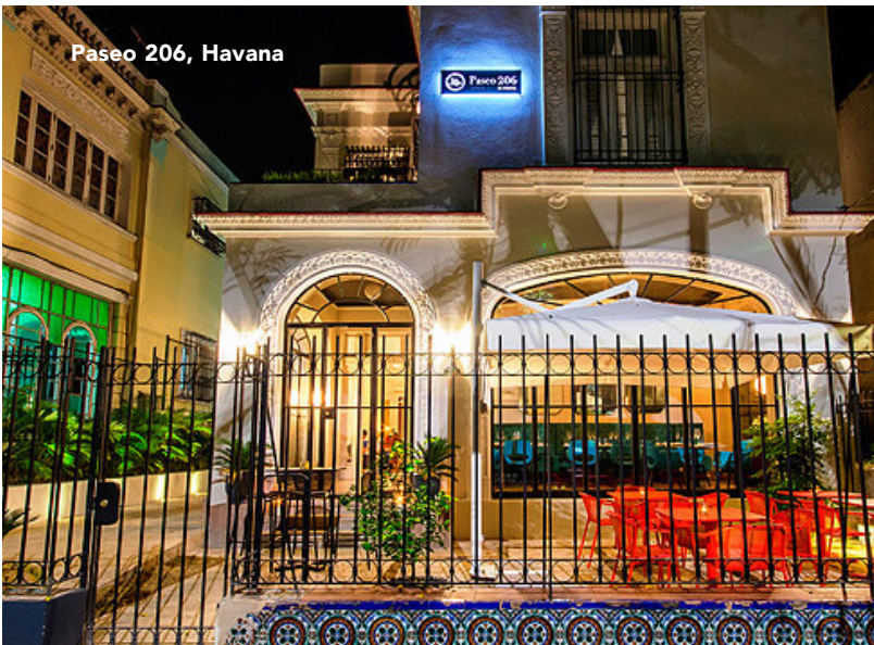
Paseo 206, Havana