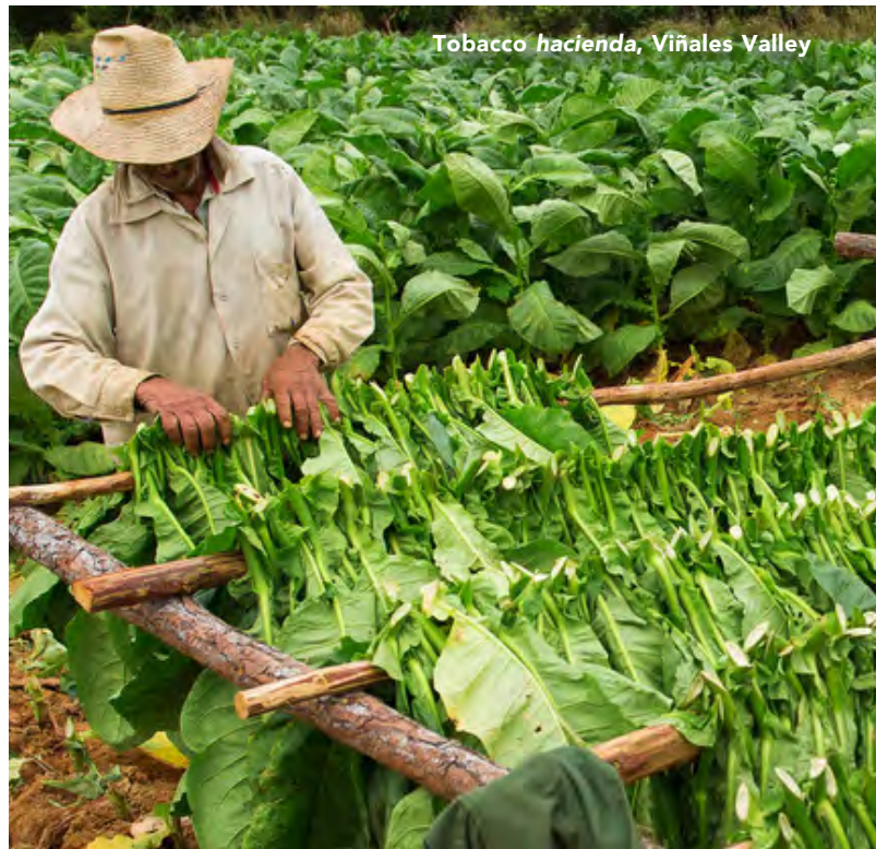
Tobacco hacienda , Viñales Valley

On a private morning tour at the National Museum of Fine Arts of Havana, join an independent curator to trace Cuba's history through the works of its greatest artists. After lunch, walk down Calle Obispo, Havana's main shopping street; explore a local design shop; and speak to the owners about small business practices in Cuba. In the early evening, drive to The Ludwig Foundation of Cuba, one of the few Cuban NGOs, for a presentation on Cuban art. The Foundation's President will host a cocktail reception and buffet dinner on the penthouse terrace, where invited guests include local Cuban artists. This evening, you may opt to attend a performance at one of Havana's famed music venues, including the legendary Tropicana. B,L,R,D