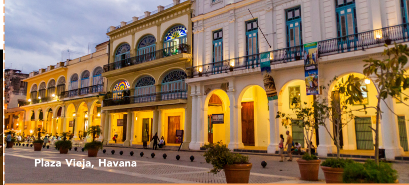
Plaza Vieja, Havana

NOT INCLUDED IN RATES International airfare; Cuban visa; Cuban Departure tax; limited Cuban health insurance policy (required for all foreign travelers to Cuba under age 80); passport fees; alcoholic beverages other than noted in inclusions; personal items and expenses; travel insurance; airport transfers other than for those on suggested flights; trip insurance; any other items not specifically mentioned as included.