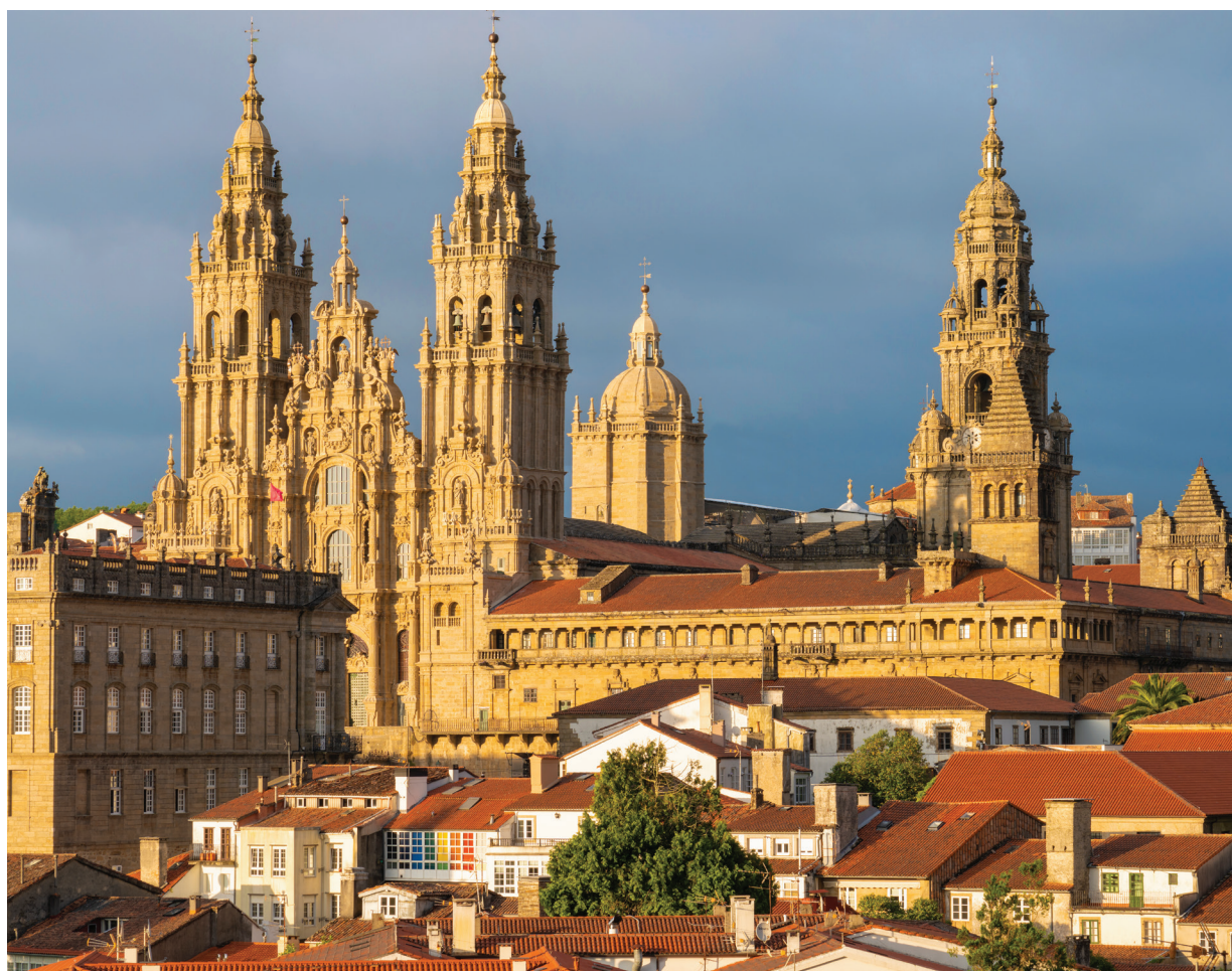
Santiago's 11 th -century cathedral, which we visit on Day 7, is the last stop on the pilgrimage route of the Way of St. James.