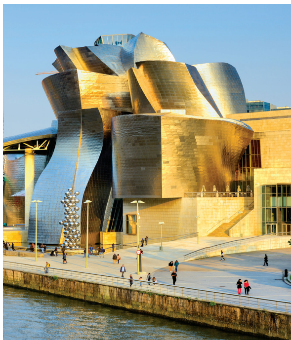
We tour Bilbao's Guggenheim on Day 10.

Day 10: Bilbao This morning's tour begins in Bilbao's medieval Old City, with a charming mix of narrow cobblestone streets and inviting squares. We see the Catedral de Santiago (c. 1379), once a stop on the pilgrimage route; monumental Plaza Nueva; and busy seaside La Ribera market. Then we take a guided tour of the Guggenheim and its contemporary art collection. Designed by architect Frank Gehry, the jaw-dropping structure of limestone, titanium, and glass has drawn acclaim, attention, and visitors to this popular, revitalized city. Our last stop is Bilbao's Fine Arts Museum, with a rich collection of Spanish and Basque artworks. B,D