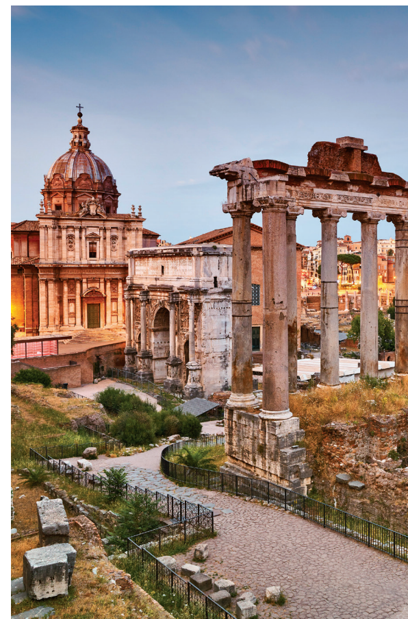
The Roman Forum dates to the 7 th century BCE.

Day 16: Depart for U.S. We depart early this morning for our connecting flights to the U.S. B