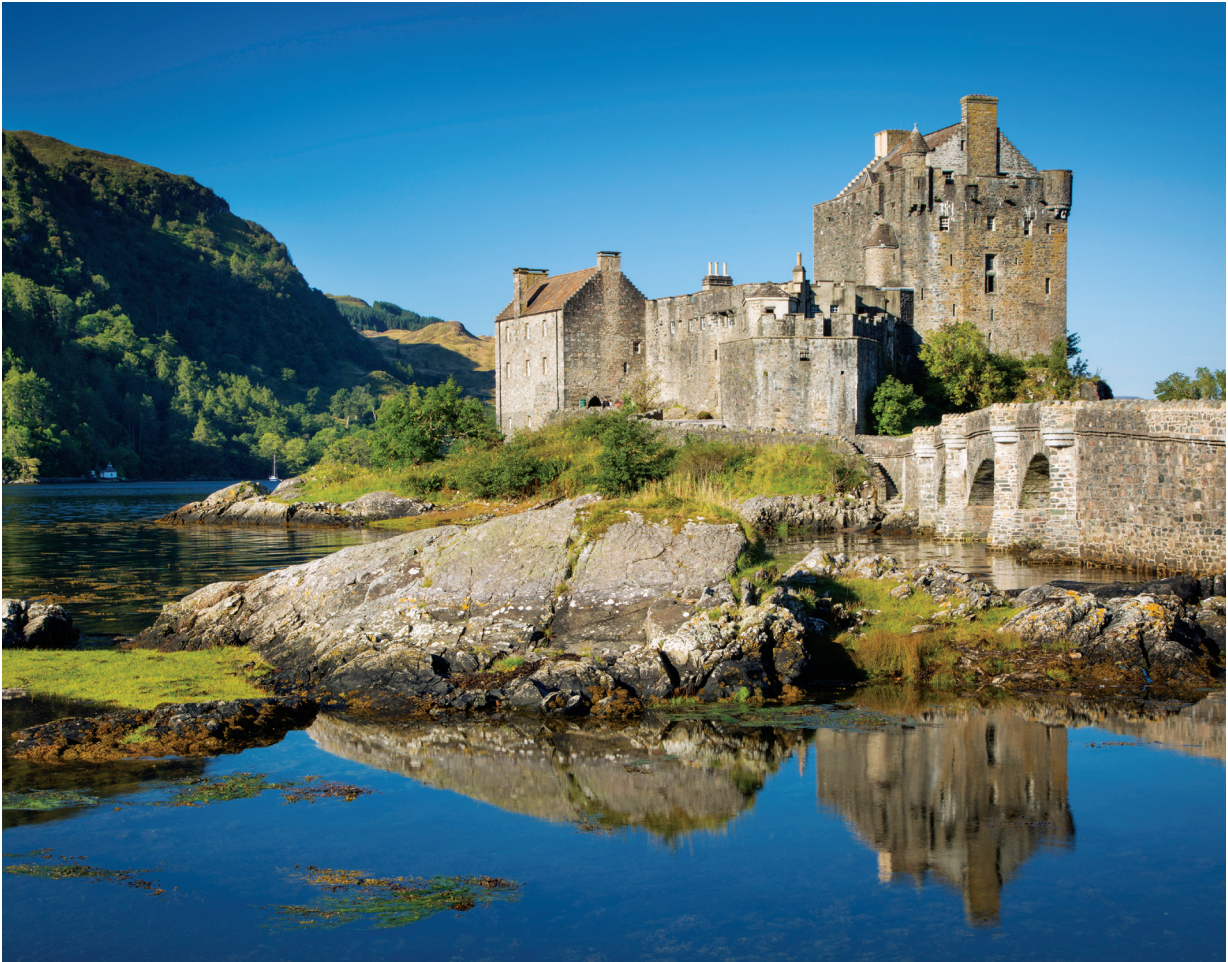
Eilean Donan Castle, which we visit on Day 5, stands as one of Scotland's most beautiful fortresses.