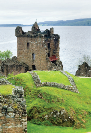
Urquhart Castle at Loch Ness

Day 7: Highlands Our exploration of the Highlands continues on today’s excursion along the Pictish Trail, sites connected with the late Iron Age/early Medieval Celtic people who once lived here. We visit striking Dunrobin Castle & Gardens, where we see a falconry demonstration then embark on a tour and tasting at a small local distillery that has been producing hand-crafted single malt whisky for generations. We continue our drive along the scenic coastal road