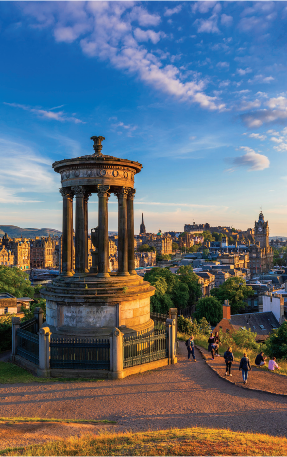
Edinburgh skyline, from Calton Hill

Day 10: Edinburgh Our morning tour of this stately city built on seven hills features both the 18 th -century Georgian “New Town” and the medieval “Old Town” – together, the districts form a UNESCO site. In the Old Town, we pay an inside visit to Edinburgh Castle, symbolic heart of the country. We also travel the Royal Mile, the warren of medieval streets that form the thoroughfare stretching from the castle to Holyrood Palace, official residence of the Queen when in Scotland. This afternoon is at leisure to discover Edinburgh as we wish; museums, galleries, and shops abound. B