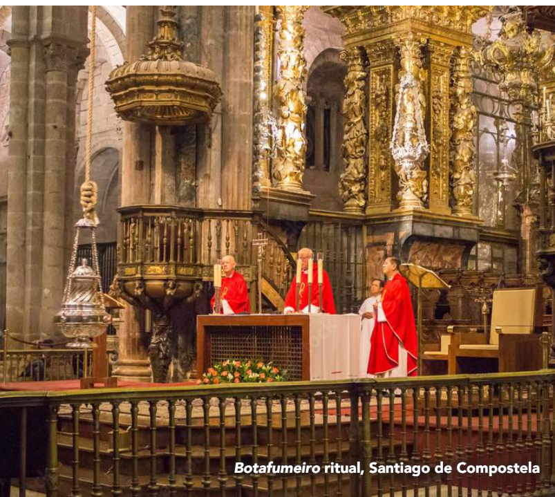
Botafumeiro ritual, Santiago de Compostela

DISCLAIMER: The itinerary is subject to change at the discretion of Duke Travels and Arrangements Abroad. For complete details, please carefully read the terms and conditions at www.arrangementsabroad.com/terms .