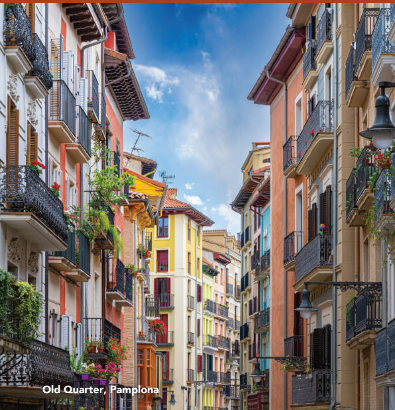
Old Quarter, Pamplona