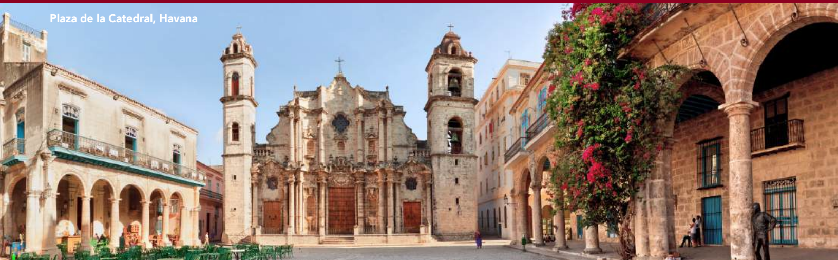
Plaza de la Catedral, Havana