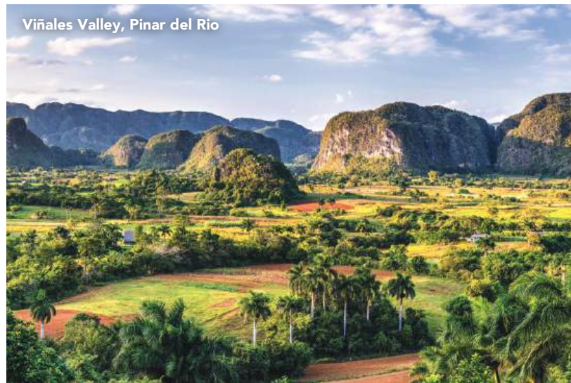
Viñales Valley, Pinar del Río

Before returning to Havana, visit the studio of a local painter who has charted the history of his community through his work. Tonight, enjoy dinner on your own. Your tour director or local guide can share recommendations for privately owned restaurants near the hotel. B,L