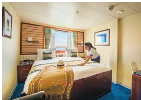
Comfortable Category 4 cabin.

Cabins and suites face outside with large windows and feature twin beds that convert to a queen. With private facilities, climate control, nightstands, desk, and storage. Seven sets of cabins with a connecting door and nine solo cabins.