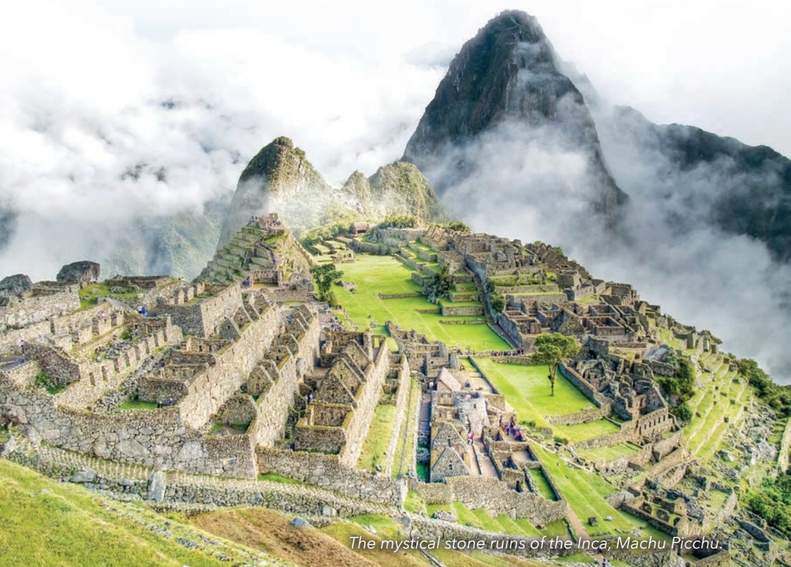
The mystical stone ruins of the Inca, Machu Picchu.

16 DAYS/15 NIGHTS—ABOARD NATIONAL GEOGRAPHIC ENDEAVOUR II + LAND EXCURSION