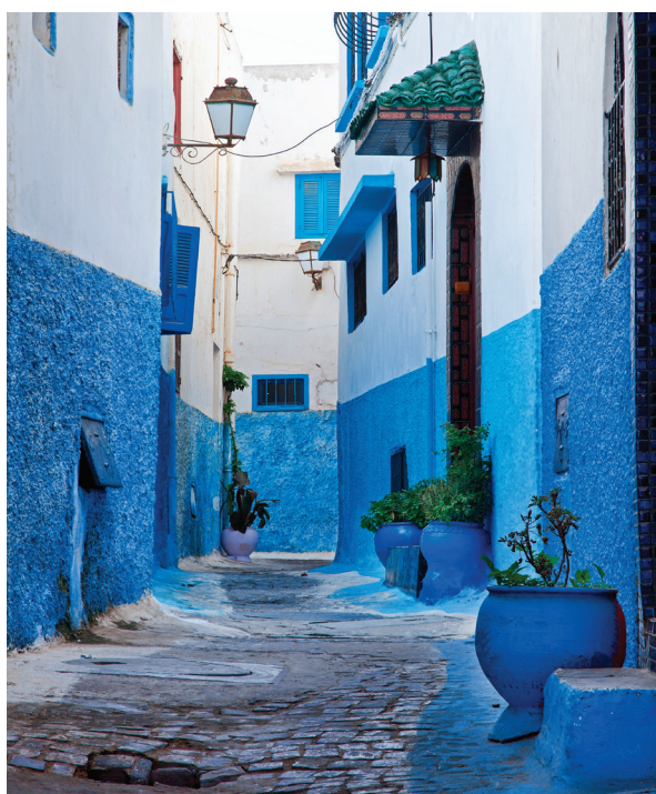
Rabat's Kasbah des Oudaias

Day 8: Erfoud/Rissani/Merzouga This morning we visit the city of Rissani, with its 18 th -century ksar , a virtually impenetrable warren of alleys. We enjoy a tour highlight this afternoon as we set out on a sunset excursion to the breathtakingly beautiful sand dunes at Merzouga on the edge of the Sahara. In the enormous silence we watch the sun set over the desert as we take a camel ride along the erg . Following this experience, we'll have dinner together in this desert setting before returning to our hotel tonight. B,L,D