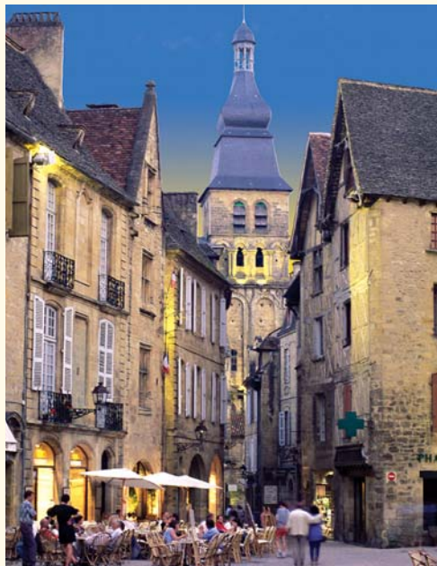
Enjoy two dinners featuring traditional French cuisine at specially selected local bistros.

Petit Saint-Amand-de-Coly is one of the most picturesque villages in Dordogne,