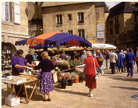
Experience Sarlat-la-Canéda's twice-weekly market, a medieval tradition in the heart of the village.

CULTURAL ENRICHMENT: Enjoy a private, traditional, 19 th -century French folk music and dance performance.