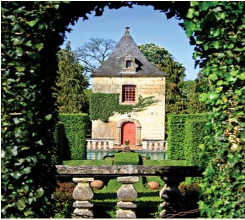
Admire the finest "English" gardens in France as you stroll through the enchanting grounds of Eyrignac Manor.