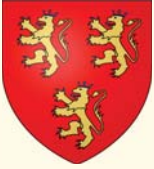
Dordogne Coat of Arms

Experience firsthand the true character and traditions of Dordogne during this comprehensive, small group travel program featuring the beautiful départements and countryside of southwestern France, the medieval village of Sarlat-la-Canéda within the oak-forested Périgord Noir and the world's largest collection of magnificent prehistoric art. Enjoy an enriching travel experience like no other and an excellent value, including all accommodations, specially designed excursions and most meals.