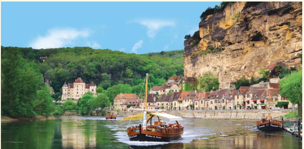
Sail the bucolic Dordogne River aboard a traditional 19 th -century wooden gabare, the typical mode of transportation of the Périgord region for more than 150 years.