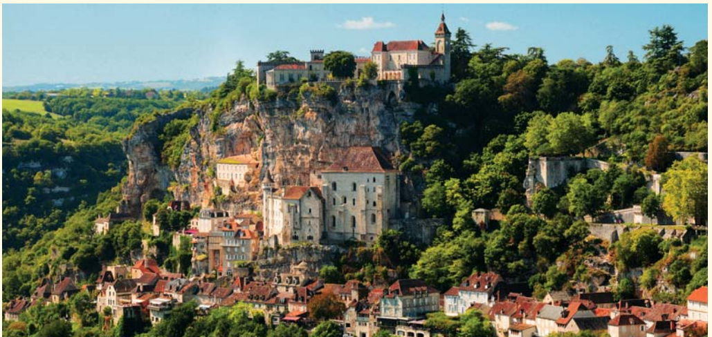
Part of the UNESCO World Heritage St. James’ Way pilgrimage route, Rocamadour has for centuries beckoned travelers to its lofty summit above a tributary of the Dordogne River.

CULTURAL ENRICHMENT: Attend the private, specially arranged presentation by a local expert on preserving medieval architecture in Sarlat.