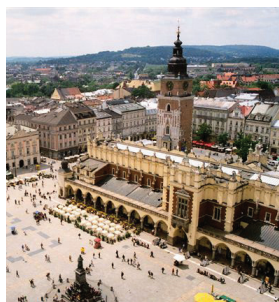
The Main Market Square of Krakow.

Day 15: Prague We spend the morning exploring the Hradcany (castle) district, home of the distinctive castle towering above the Vltava River. Dating to the 9 th century, the castle today is the seat of the president of the Czech Republic. Among the highlights of our tour: a visit to Gothic St. Vitus' Cathedral and a stroll along Golden Lane, with its picturesque artisans' cottages. The remainder of the day is free to continue exploring