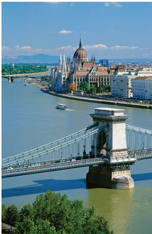
The stately Chain Bridge links Budapest's east and west.

Day 17: Depart for U.S. We transfer to the airport early today for our connecting flights to the U.S. B