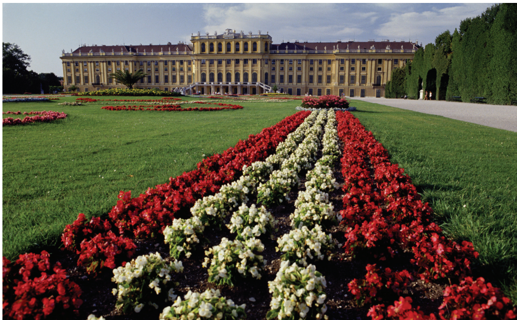
Vienna's majestic Schönbrunn Palace

Day 6: Krakow This morning we tour the Wieliczka Salt Mines, a UNESCO World Heritage site. This afternoon is at leisure. B