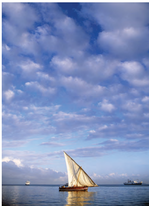
Traditional dhow sails off Zanzibar.

influences (though predominantly Muslim today), Stone Town boasts a labyrinth of narrow alleys lined with shops, homes, hidden courtyards, and extravagantly carved wooden doors, as we see on our afternoon tour. Highlights include the open air market, teeming with exotic fruits and vegetables; the 19 th -century Cathedral on the site of a former slave market; the Old Fort, offering lovely views of town and the ocean; and “Tippu Tip House,” residence of a notorious slave trader. Dinner tonight is on our own. B,L