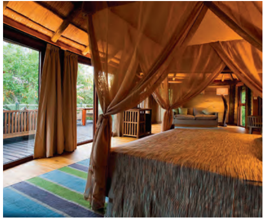
Nature surrounds the lodge’s eco-friendly cabins.