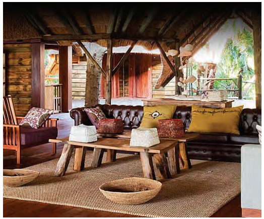
Sanctuary Saadani River Lodge, our luxury retreat