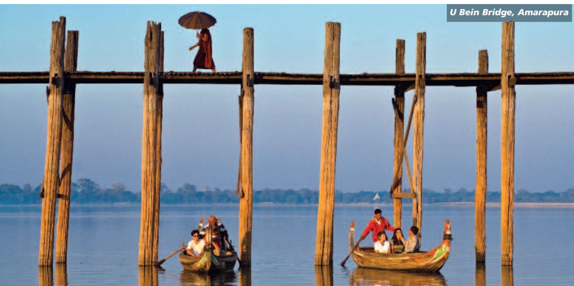
U Bein Bridge, Amarapura