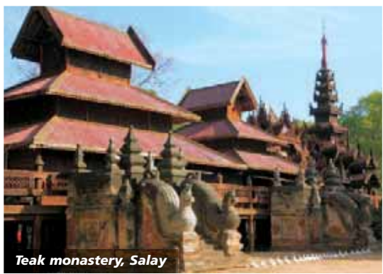
Teak monastery, Salay