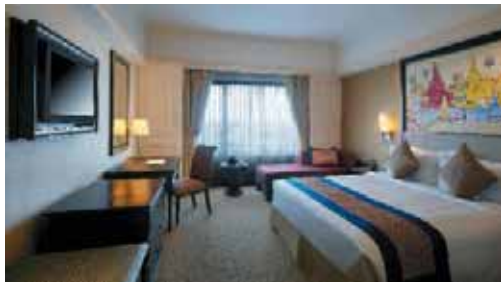
SULE SHANGRI-LA YANGON

Our travel experts have selected these luxury properties, each in a prime location, for your comfort. Details in the design and décor celebrate the local culture and enhance the ambience of each hotel. Their restaurants feature menus of elegantly prepared local and international cuisine. Of utmost importance is the superior quality of the services, amenities and accommodations, allowing you to maximize the enjoyment of your stay.