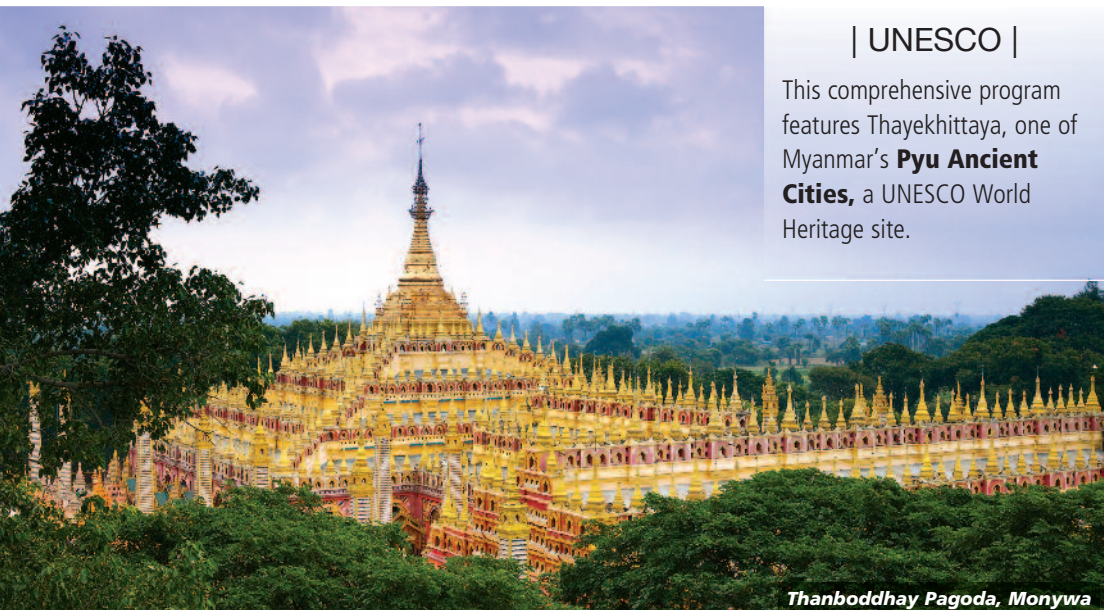
Thanboddhay Pagoda, Monywa

This comprehensive program features Thayekhittaya, one of Myanmar's Pyu Ancient Cities , a UNESCO World Heritage site.