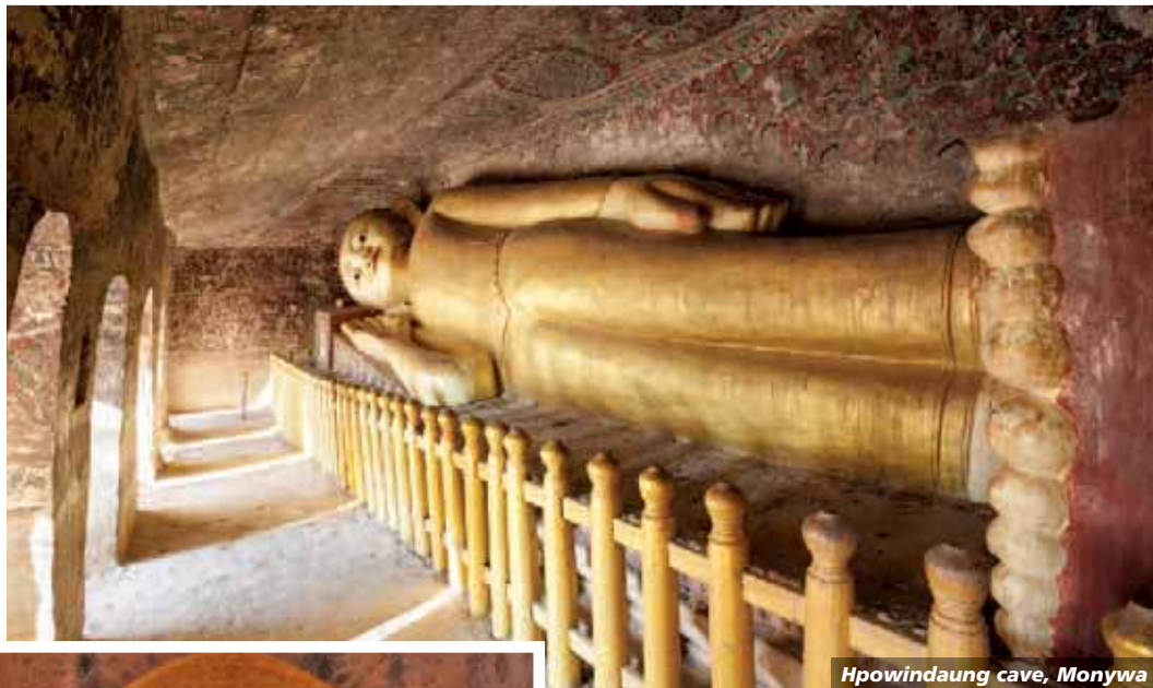
Hpowindaung cave, Monywa