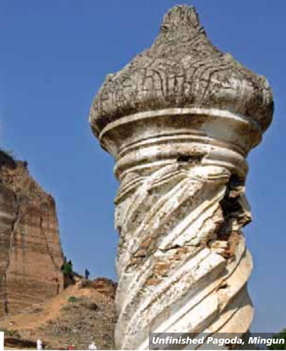
Unfinished Pagoda, Mingun