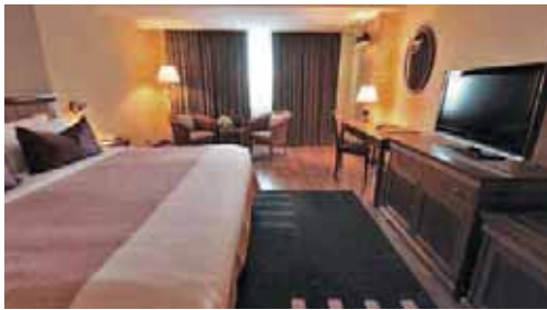
MANDALAY HILL RESORT & SPA MANDALAY