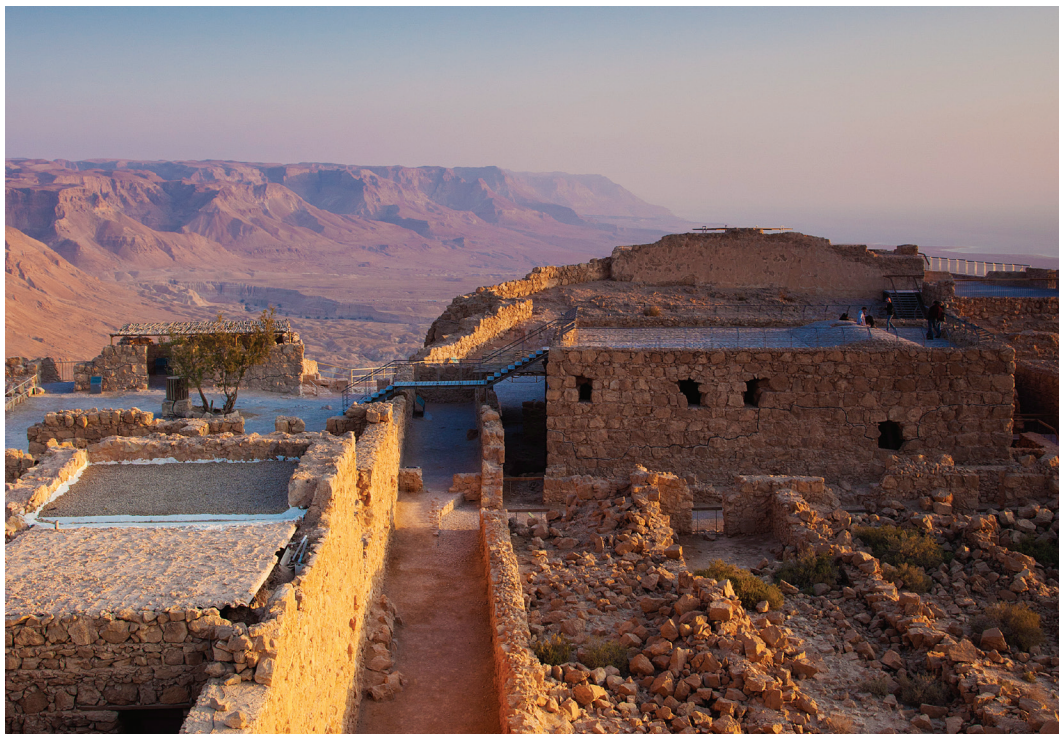
We explore the ruins at Masada on Day 11.

both Judaism and Christianity, this ancient city has attracted visitors, settlers, and invaders for more than two millennia. B,D