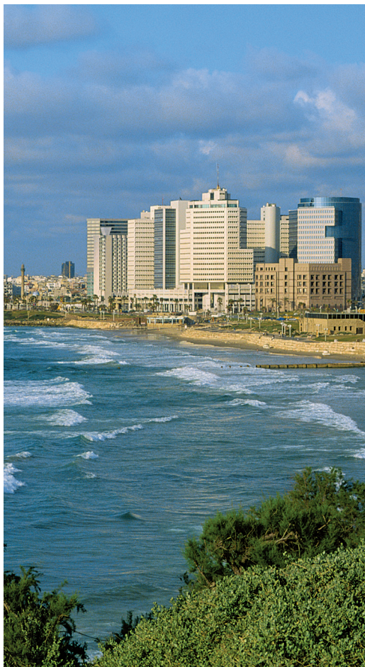
Sophisticated seaside Tel Aviv

Day 12: Depart Tel Aviv for U.S. Very early this morning we transfer by motorcoach to Tel Aviv for our connecting flights to the United States. B