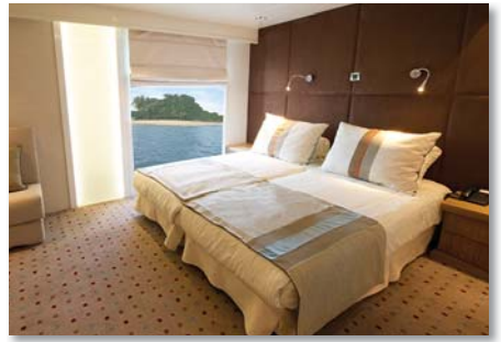
Category 1 Cabin

The English-speaking European crew provides courteous, professional service. The ship is fitted with state-of-the-art twin stabilizers and is meticulously maintained. It complies with the highest safety standards.