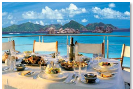
Alfresco dining on the Sun Deck