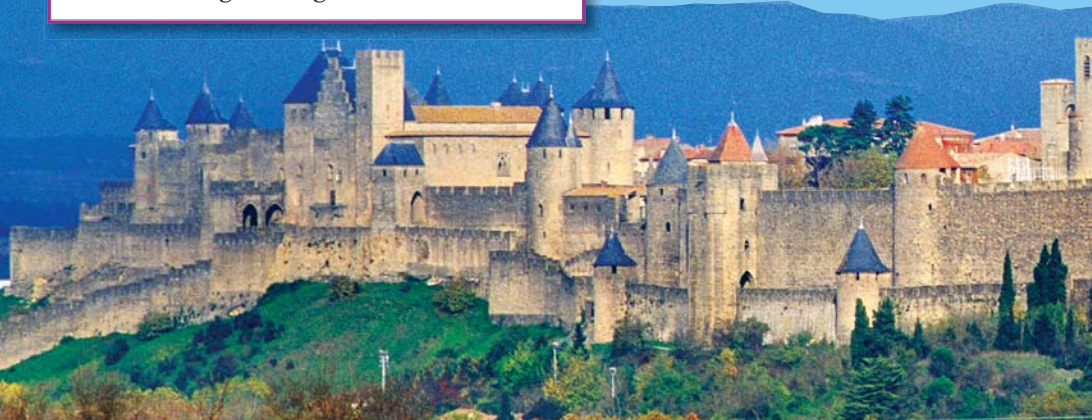
Photo this page: A fairy-tale image of towers and drawbridges, the medieval town of Carcassonne is protected by double walls nine to 15 feet thick.

Cover photo: Brightly painted houses and fishing boats line Portofino's waterfront on the Italian Riviera.