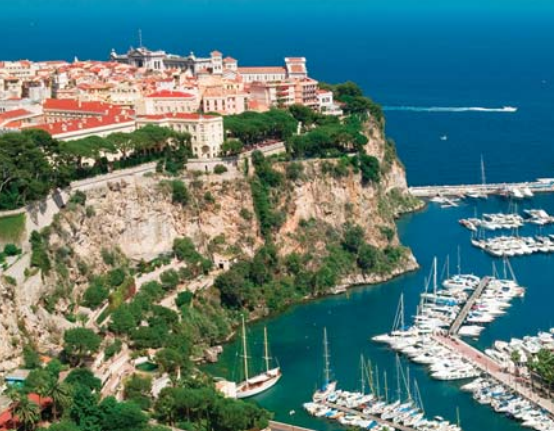
See Bonifacio's well-preserved medieval houses atop Corsica's stunning sun-bleached limestone cliffs.