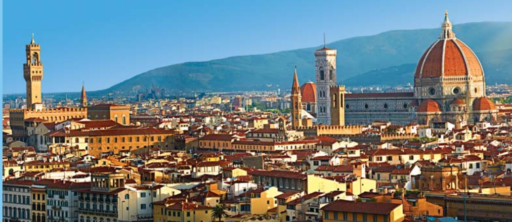
The distinctive early-14 th -century tower of the Palazzo Vecchio and Filippo Brunelleschi's magnificent 15 th -century dome are consummate symbols of Florence and the Renaissance.