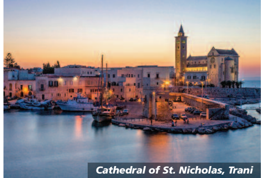
Cathedral of St. Nicholas, Trani