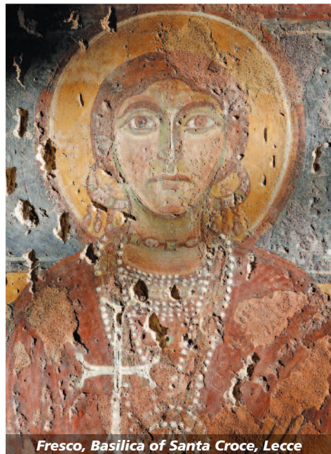
Fresco, Basilica of Santa Croce, Lecce

Our personalized air program allows you to select your flights, routing, class of service and dates of travel in consultation with one of our experienced Passenger Service Representatives. Airfares will vary, depending on airline, routing and class of service. In most cases, transfers between the airport and hotel/cruise ship will be included on arrival and departure days. Your Passenger Service Representative will provide you with all of the details you need to guarantee your transfer. Book your air with us to ensure assistance in the case of schedule changes or delays that may impact your air travel plans. AHI FlexAir participants automatically receive flight insurance worth up to $250,000, subject to policy terms.