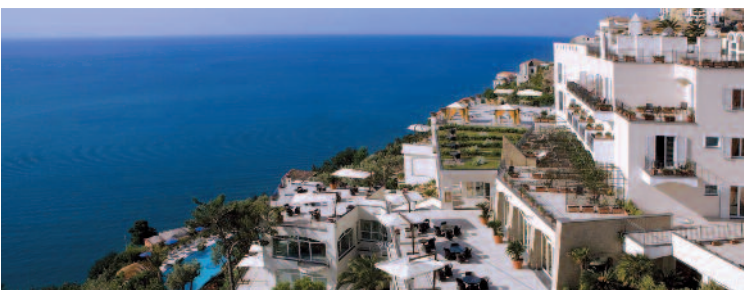
HOTEL RAITO | VIETRI SUL MARE

With breathtaking views of Polignano a Mare's Cala Porto cove, this first-class hotel sits in one of the world's most enchanting locations. After an active day of exploring, unwind with a glass of wine or a meal at the hotel's restaurant, which offers terrace seating, panoramic views and a tempting menu that highlights the region's fresh seafood and other local specialties. Wi-Fi is available.