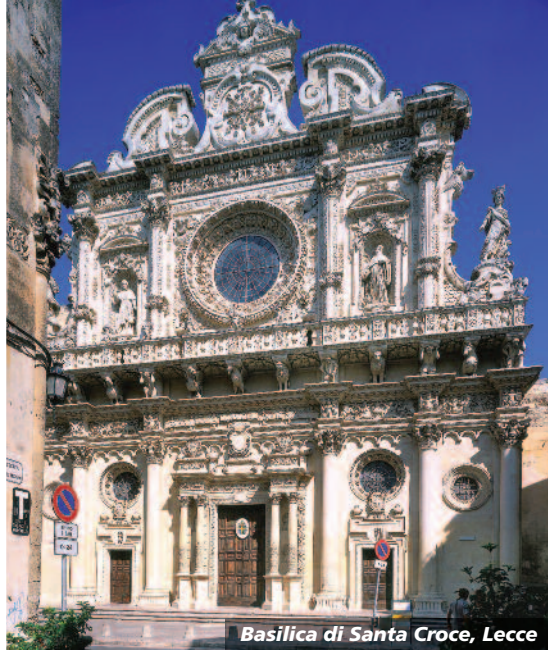
Basilica di Santa Croce, Lecce