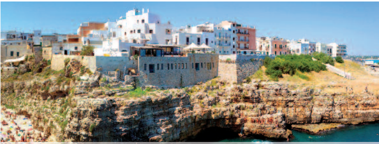
HOTEL COVO DEI SARACENI | POLIGNANO A MARE