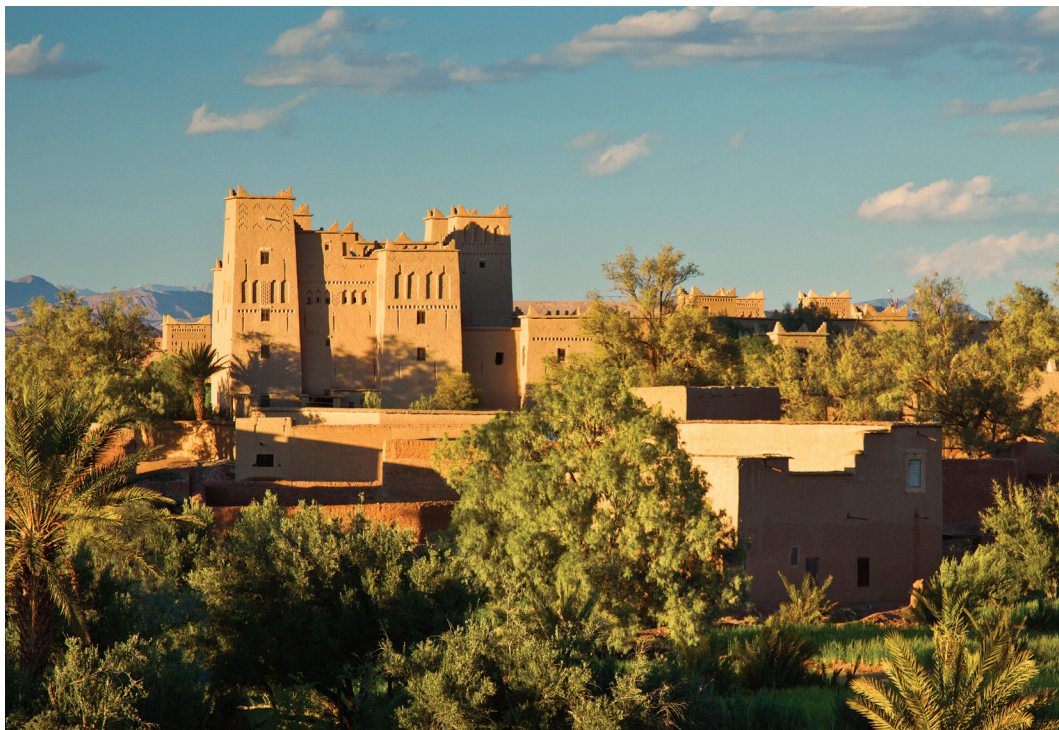
A typical kasbah, as we see along the “Route of a Thousand Kasbahs” on Days 9 & 10.

old mellah (Jewish quarter) and its 17 th -century synagogue, the royal gates, and the Museum of Fez. Tonight we enjoy a private dinner at an intimate family-run riad in Fez. B,L,D