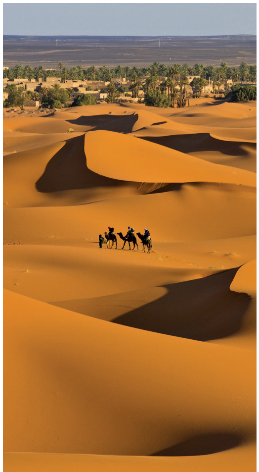
We watch the sun set over the dunes at Merzouga.