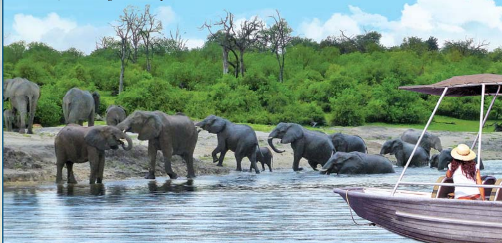
Board small excursion boats and encounter wildlife up close, like Kalahari elephant along the Chobe River.

The privately chartered, Five-Star M.S. ZAMBEZI QUEEN provides a world-class, uniquely African, intimate and deluxe small river ship experience in one of the most remote locations on Earth, and offers extraordinary game-viewing opportunities distinctly different from a land safari. The M.S. ZAMBEZI QUEEN is designed to navigate the Chobe River near exotic Chobe National Park, and to allow one's eye to be drawn to the constant movement of wildlife on the riverbank—elephant, Cape buffalo, rhinoceros, crocodile and a vast array of bird species—while cruising or at anchor. From your stylish “floating lodge,” local guides will lead you on unique game-viewing river safaris aboard small, custom-built, private excursion boats. Visit a native village along the river to experience the local culture firsthand, including a dance performance and artisan crafts.