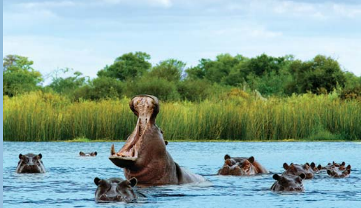
Navigate the Chobe River on a once-in-a-lifetime river safari in search of pods of hippopotamus cooling themselves in the water.