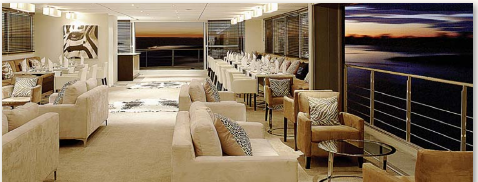
Dining Room and Lounge