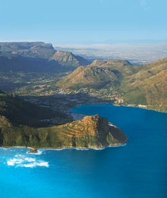
World Heritage site Table Mountain celebrates unique biodiversity and maritime history.