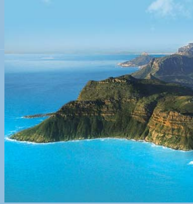
Rugged Cape Point, within UNESCO World Heritage Site Cape Floral Kingdom, draws visitors with its spectacular views.

middle class to millionaires. Its Vilakazi Street even fostered two Nobel Peace Prize laureates, Nelson Mandela and Desmond Tutu. North of Johannesburg is the vibrant capital city of Pretoria, known for its diverse architecture, purple-blossomed jacaranda trees and distinctly Afrikaans culture.