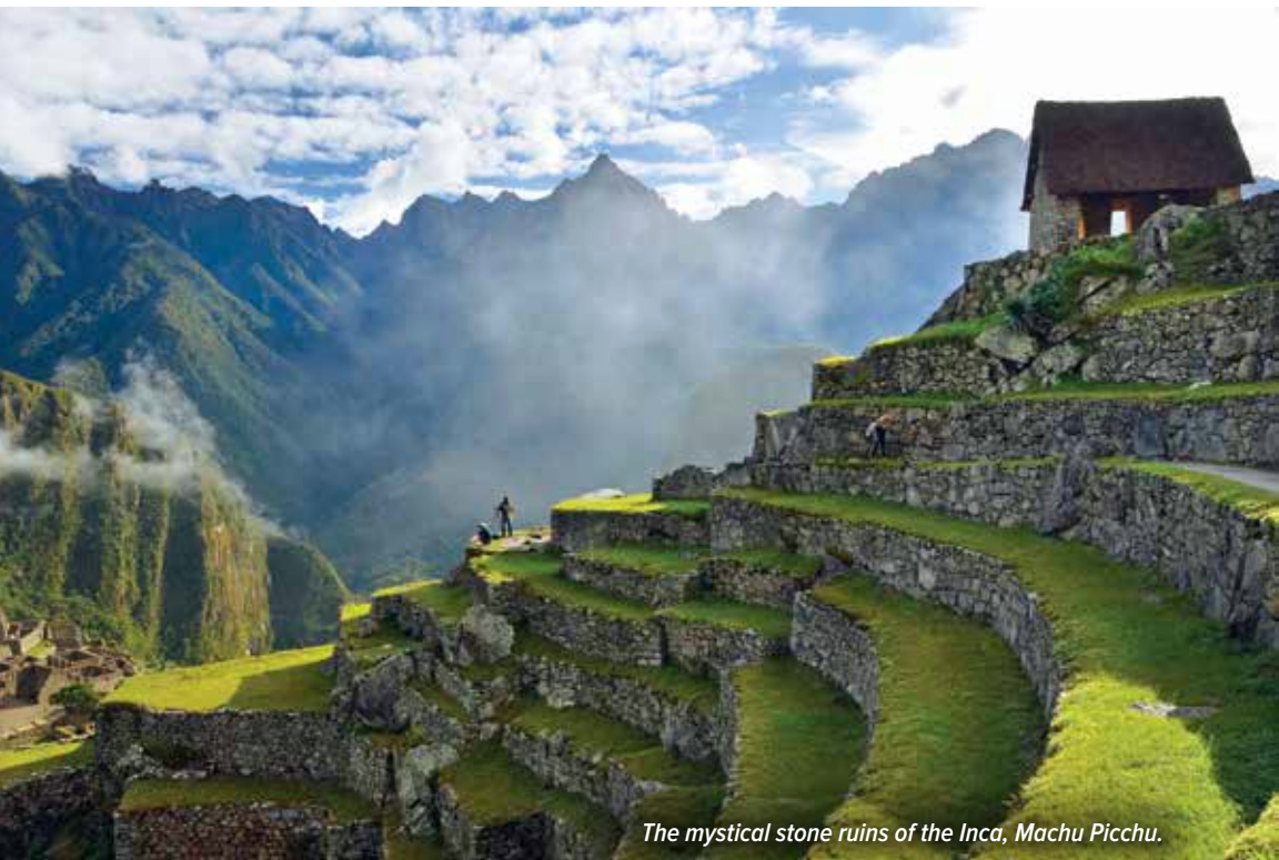
The mystical stone ruins of the Inca, Machu Picchu.

16 DAYS/15 NIGHTS—ABOARD NATIONAL GEOGRAPHIC ENDEAVOUR II