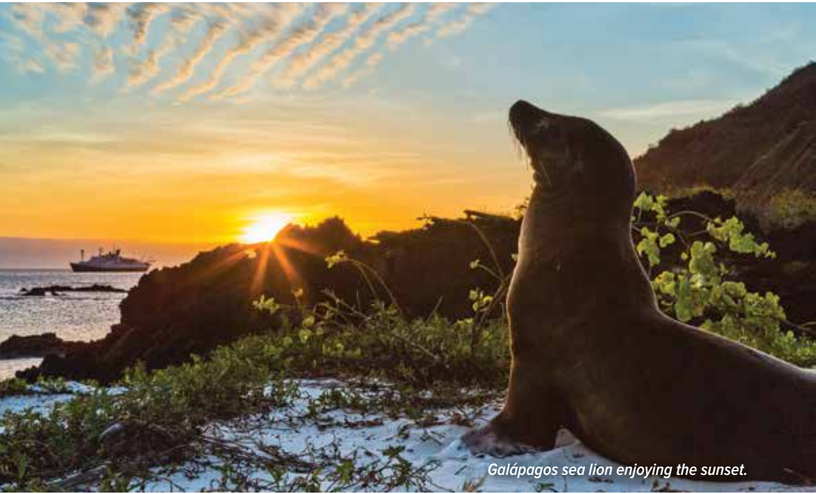
Galápagos sea lion enjoying the sunset.

10 DAYS/9 NIGHTS—ABOARD NATIONAL GEOGRAPHIC ENDEAVOUR II