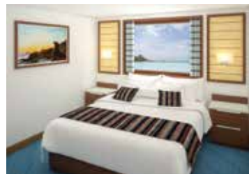
Clockwise from top: National Geographic Endeavour II will feature 52 cabins accommodating 96 guests; the new lounge's panoramic windows ensure stunning Galápagos views; artist rendering of a typical category 3 cabin.