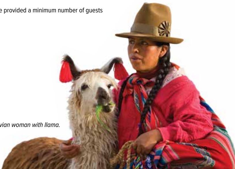
Peruvian woman with llama.

Note: Extension will operate provided a minimum number of guests are registered.