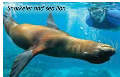
Snorkeler and sea lion.

The Galápagos undersea is a marvel. Snorkelers will enjoy encounters with sea lions, sea turtles, penguins, tons of fish, and even multiple shark species. You'll have opportunities to snorkel nearly every day, and we'll provide all your snorkeling gear, including wetsuits. Prefer to stay dry? The ship is equipped with a glass-bottom Zodiac. Or let the undersea specialist be your 'eyes.' An integral member of the expedition team, he or she will snorkel, shoot video, and present it during evening recap in the lounge for all to enjoy.