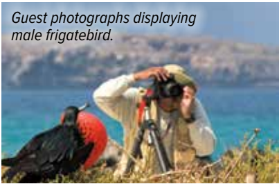
Guest photographs displaying male frigatebird.

An exclusive expedition photography program means that you travel with, and benefit from, an onboard Lindblad-National Geographic certified photo instructor. A naturalist who has been trained to teach by the best in the business at National Geographic, he or she will help you better understand your camera settings, the basics of composition, and how to capture incredible wildlife behavior. So whether you use a smartphone, a point-and-shoot, or a sophisticated DSLR, count on returning home with improved skills and your best shots ever.